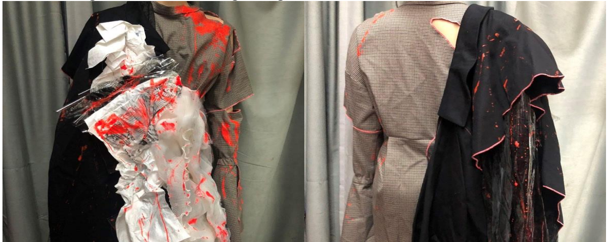
Figure 7:Denim fabric.

The rendering of denim clothing fabric is shown in Figure Figure 7: