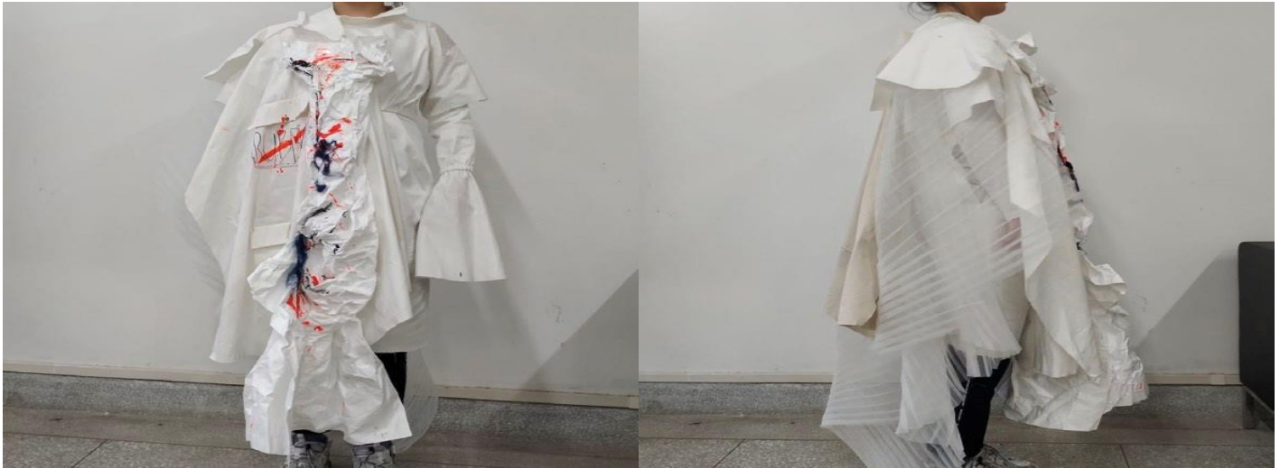
Figure 10: Sample clothes making drawing front and side.