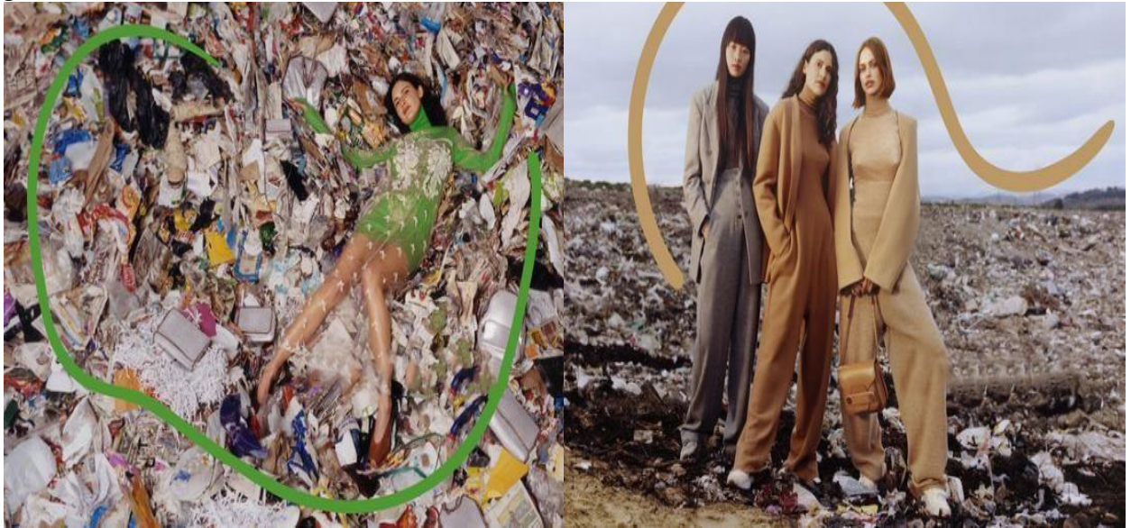
Figure 4: Stella McCartney 2017 Autumn and winter series of advertising.