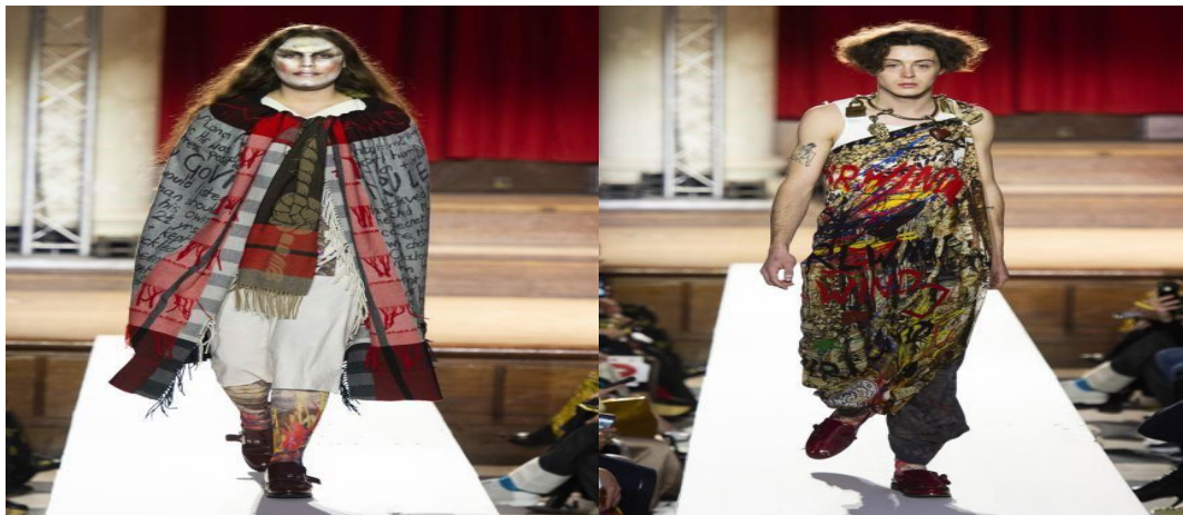
Figure 3: Vivienne Westwood Autumn / Winter 2019.