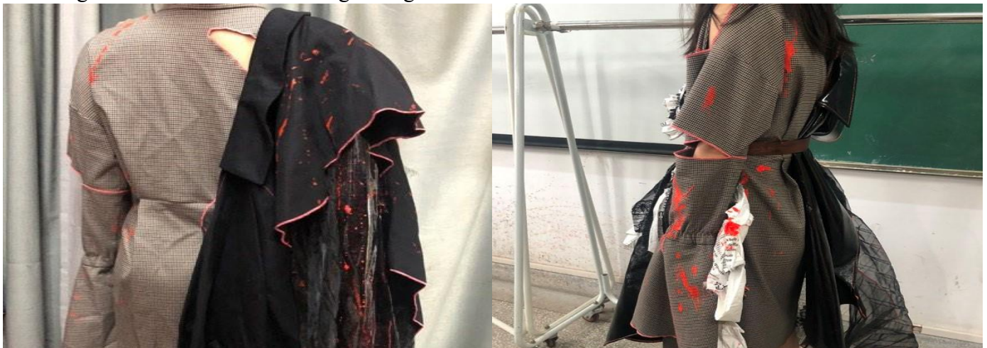
Figure 8: Thousand bird box fabric.

The rendering of the fabric is shown in Figure Figure 8: