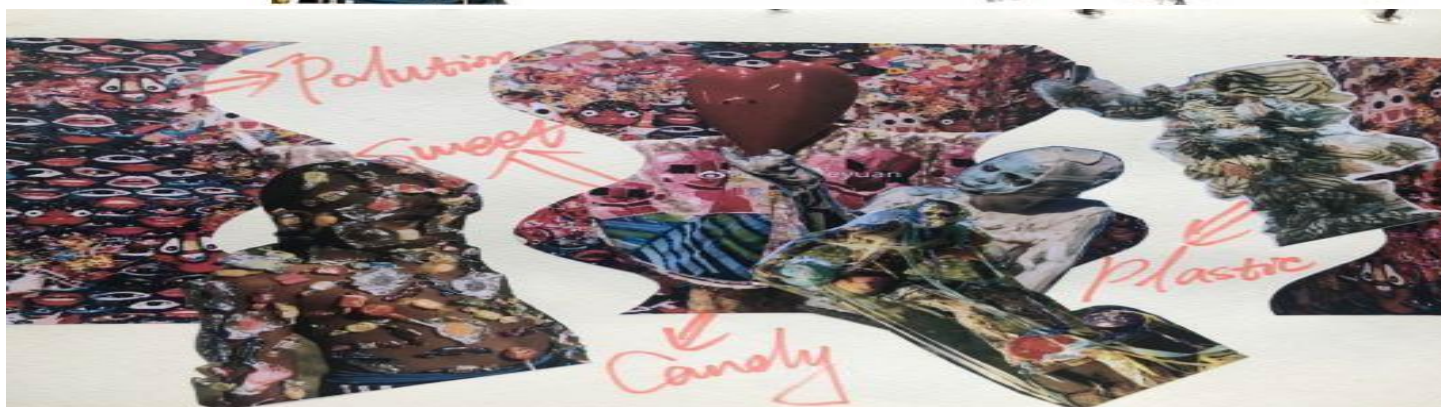
Figure 5: Environmental art design drawing.