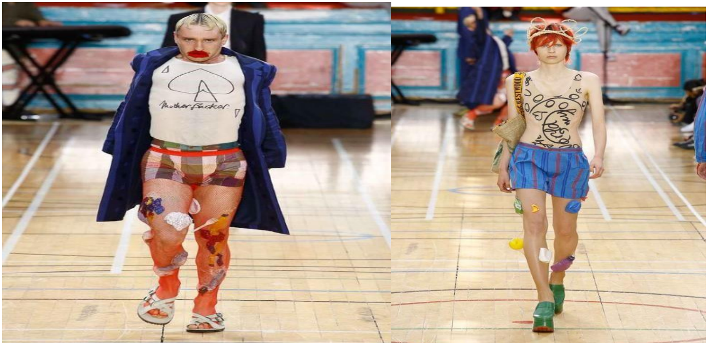
Figure 2: Vivienne Westwood Spring / Summer, 2018 .