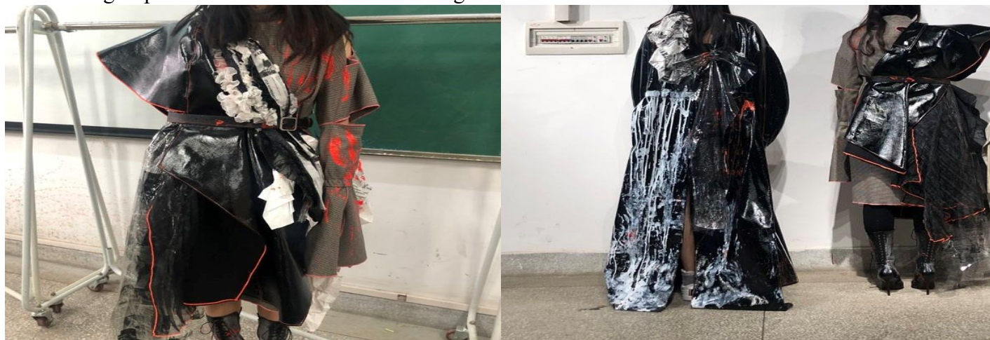
Figure 9: Patent leather fabric fabric.

The rendering of patent leather fabric is shown in figure 9: