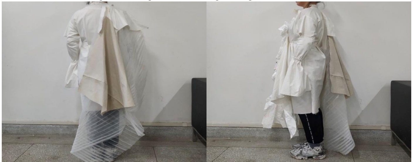
Figure 11: Sample garment making drawing back and side.