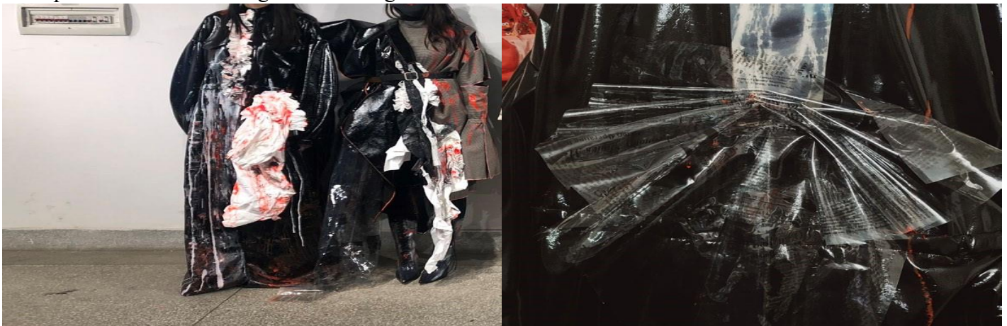
Figure 12: Garment making detail drawing.

See the pictures as shown in figure 12 and figure 13: