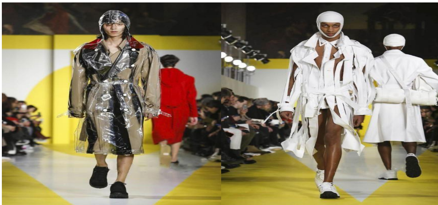
Figure 1: Maison Margiela Autumn and winter 2018.

In an interview with the British version of ELLE, designer Stella McCartney revealed that she will use environmental awareness to better respond to her clothing brand. In the future, clothing design and production will be used in large quantities, as well as an environmentally friendly flagship store in London, UK. The design of the flagship store to the use of the store permeates the concept of environmental protection, and is known for its environmental friendliness.