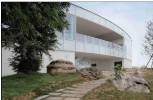
Figure 6: Wulong·Lanba Art Museum—Exterior