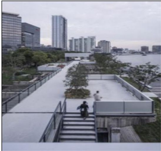
Figure 4: Shanghai Yicang Art Museum-Viewing Platform

The flower belt on the side facing the river is also designed in a rectangular staggered manner. On the other side is filled with trees and lawns. The square style is consistent with the design of the building. This design not only contributes to the design of the art museum. It can also be used as a pavement and a viewing platform for people who appreciate the scenery of Huangpu River.