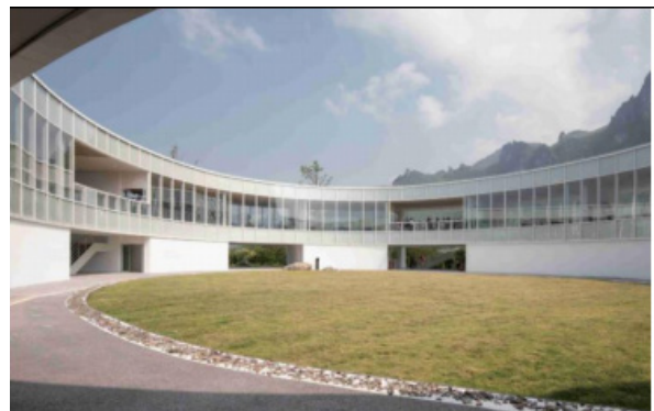
Figure 7: Wulong·Lanba Art Museum—Interior

The representative of transparent boundary space design is Chongqing Wulong Lanba Art Museum (Figures 6 and 7). Its architectural design is similar to that of Fujian Hakka earth building. It is located on a hillside and surrounded by vegetation and mountains. The building