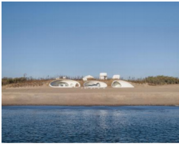
Figure 1: UCCA Dune Art Museum - Appearance

buildings are built according to the terrain and use local materials, forming natural green buildings in the north, namely earth-damaged buildings. For example: Shanyue Qianshan Art Museum (Figures 1 and 2), built in the remnant of Taihang Mountain, is attached to the Huangshi Hills, and the hills are surrounded by curved gullies, among which there are traditional cave dwellings. The building materials are taken from the local loess, and red clay is combined with rammed earth to form a distinct texture of the earth unique to the loess hills. The designer adopts a combination of modern and traditional masonry methods, integrates loess and stone into the building, and gives contemporary art architecture the characteristics of natural simplicity and infinite wildness.