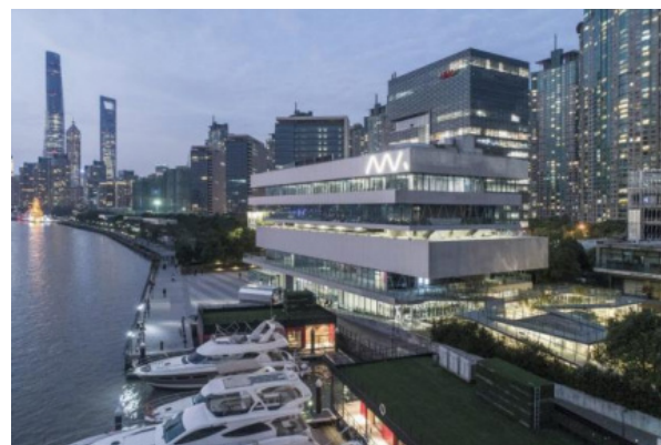
Figure 3: Shanghai Yicang Art Museum