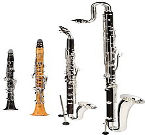
Figure 1: Schematic diagram of single tube spring

performance can they fully understand and express the melody, rhythm, emotion and other elements of a musical work, thus laying a solid foundation for the performance effect of the musical work.