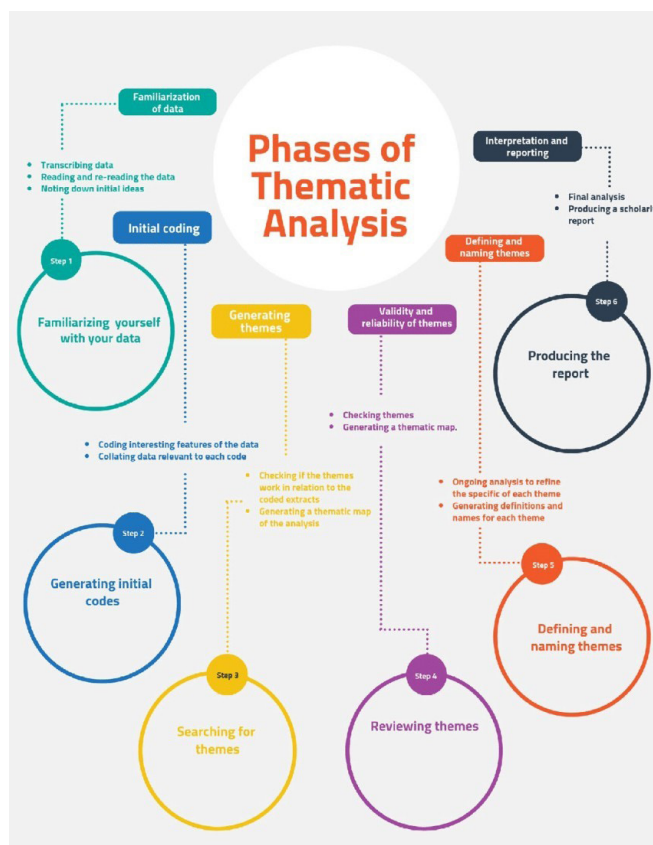
Figure 1: Phases of Thematic Analysis of Braun & Clarke (2006)