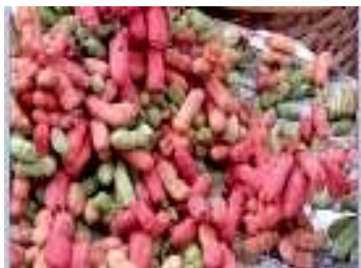
Dennettia tripetala fruits

seizure that can possibly offer the required opportunities for the isolation of important compounds which can be used in the development of better, affordable and well tolerated antiepileptic drugs. Thus, the ineffectiveness of these synthetic drugs, along with their serious side effects makes any safe and effective herbal medicine an attractive possibility. Therefore, this work investigates the effect of the ethanolic extract of D. tripetala fruits on the isoniazid induced seizure on the hematological parameters and temporal lobe histology. It showcases the comparative therapeutic potentials of D. tripetala extract and sodium valproate. This knowledge can be used by pharmaceutical industries to produce cheaper and less toxic drug for the populace or serve as an alternative for seizure therapy.