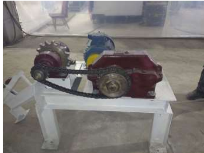
Fig.3. General view of the drive to the drum dryer.

rpm, the diameters of the pulleys and sprockets installed on the drive drive were selected.