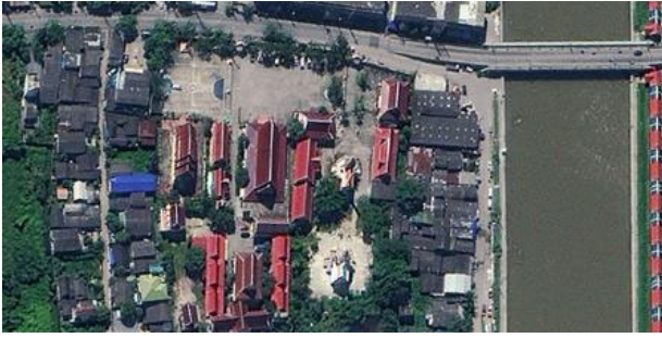
Figure 1. Experimental image