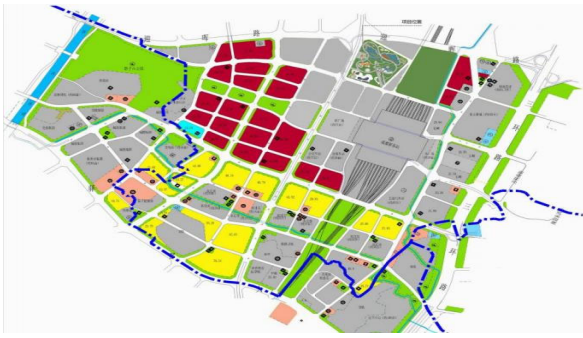
Figure 2. Location analysis diagram of the project