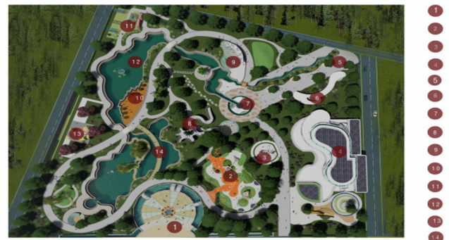
Figure 1. General plan of urban parks practicing dual carbon

The five elements of landscape design are landscape terrain, plants, buildings, squares and roads and garden sketches. Among them, landscape terrain and plants are soft landscape, which refers to the living and natural composition of landscape composition. Soft landscape is an important way to fix carbon and release oxygen in landscape. Hard landscapes are inanimate and man-made, such as buildings, squares and roads, and garden sketches such as rockeries and pools. Practicing the concept of low-carbon design in urban park design. [10] I put forward my design ideas from the following four aspects ( Fig.1 ) :