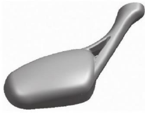
Figure 1. Rearview mirror model

The three sides of the rearview mirror using stretch, the top surface can be used mesh, the form of each round corner is not consistent, need round corner bridge, determine the stereo dividing line of the rearview mirror, and dividing line as the boundary, the tilt direction on both sides is opposite. When the corners are rounded, the corners on both sides of the parting line should be repaired. The rearview mirror support frame also needs to determine the classification line, and some parts after classification need to be further decomposed according to the modeling needs.