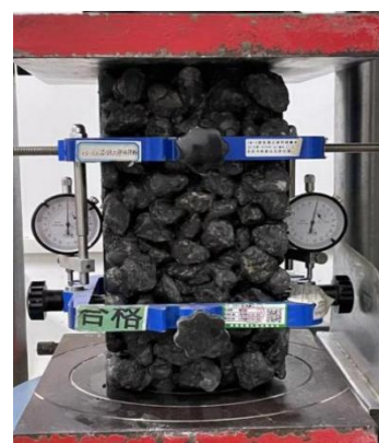
Fig 1. Ecological porous concrete elastic modulus meter

during the applied load are accurately recorded.