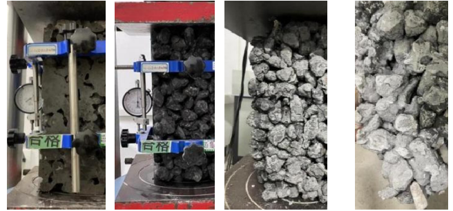
Fig 2. Prismatic destruction process

See Figure 2 for the destruction process diagram of the specimen: