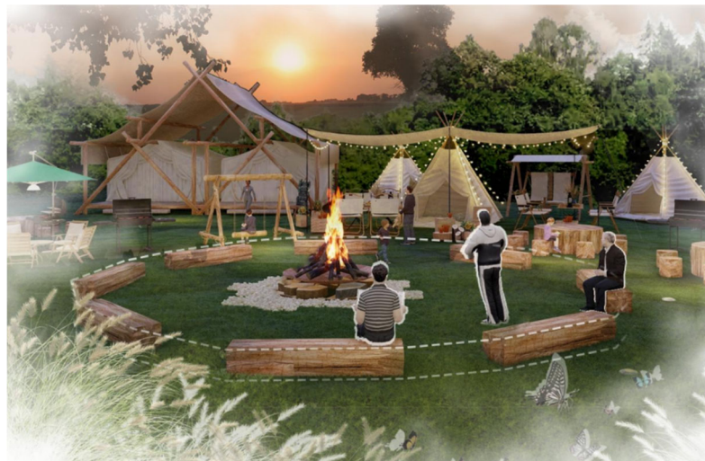
Figure 5. Illustration of activities in natural areas