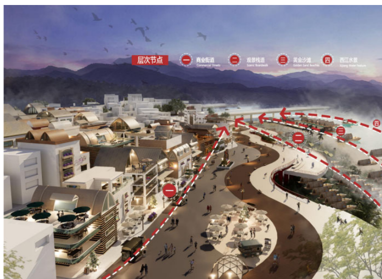
Figure 3. Spatial hierarchy of the periphery of the plank road

The creation of the B&B building space is not only about the building itself, but also about the surrounding environment, and the creation of the surrounding space atmosphere will greatly affect the experience and feelings of tourists on the B&B itself. The Danjia B&B in Jiangkou Village is mostly located in the scenic waterfront area, and the unique natural landscape resources attract people to stop and stay, but the only natural scenery cannot bring tourists a profound experience, and the existing natural landscape is used to increase the interaction between tourists and natural elements by creating scenic plank roads, water platforms, and golden beach characteristic attractions, and introduce natural elements into indoor and outdoor spaces, so that tourists can feel the charm of nature while enjoying the homestay services[6]. The viewing plank road is set up between the Jiangkou B&B and the riverbank, and the plank road extends outward to the four main levels of experience space of commercial streets, viewing platforms, beach vegetation and Xijiang waterscape (Fig.3)