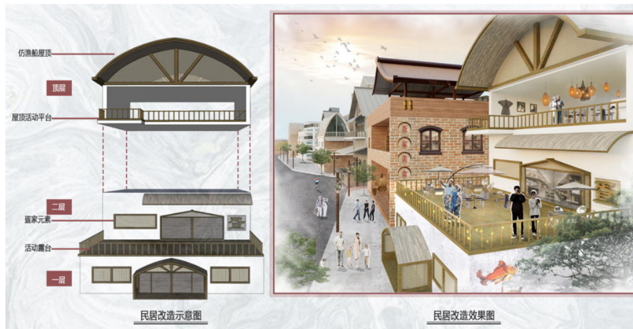
Figure 4. Rooftop houseboat layout

production activities of the people in Jiangkou not be disrupted, but it will also bring them economic income.