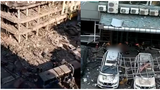
Figure 2. Scene of action

damaged power distribution lines at the site and cut power to surrounding residential areas.