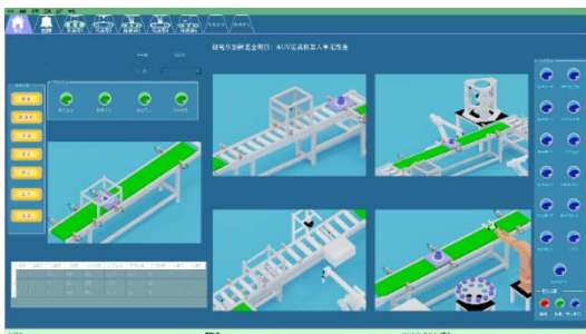
Figure 3. The interface of client

The development of Human Machine Interaction interface is mainly completed by Qt Designer. Qt Designer can complete the development of Human Machine Interaction by simply dragging widgets, modifying parameters and writing slot functions. It greatly reduces the amount of code and shortens the development cycle.