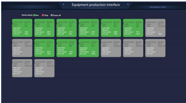
Figure 2. Data display