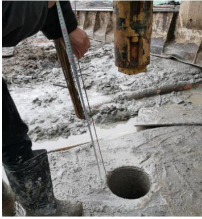
Figure 3. Lead hole depth acceptance