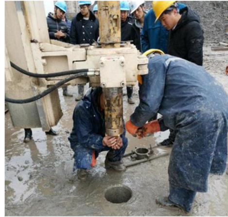
Figure 5. MJS drill pipe lowering

In this project, the 64m pile of the all-round high-pressure rotary jet construction method avoids the time process of the drill pipe being lowered, which leads to too fast refilling of the sand layer in the hole, filling the hole and affecting the lowering of the drill pipe. The first drill pipe is spliced 35m on the frame in advance, The remaining drill pipes are connected on the ground into 9m sections. After the pile driver is in place, connect the drill bit and the pressure monitoring display in the ground, and clear it when the drill bit has no load. As shown in Figure 5, start to lower the drill pipe. After the first section is completed, quickly install the second section on the pile frame according to the 9m-long section, and lower the drill pipe to the designated position within 20 minutes.