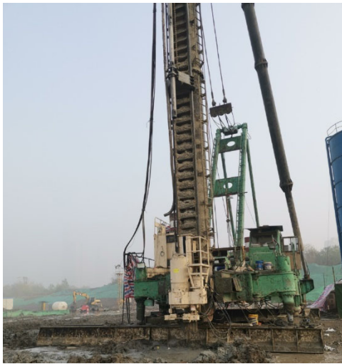
Figure 1. Process principle