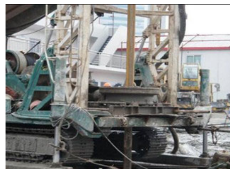
Figure 2. Geological Drilling Rig

The construction geology of this project is dominated by sand layers, and the design depth is super deep. It is particularly important for how to ensure the verticality of the pre-drilled holes after the lead-in hole and prevent the hole from collapsing and reducing the diameter. Then put the lead hole machine in place, use the geological drilling rig to lead the hole, and use the circulating mud to protect the wall, the mud specific gravity is between 1.05-1.2, the general lead hole diameter is about 200mm, the error between the hole center and the pile center is less than 50mm, and the depth is greater than the design. The depth is more than 1m, and the verticality error is less than 3/1000. See Figure 2 and Figure 3 for details.