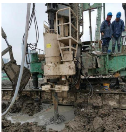
Figure 6. MJS drill pipe lowering

jetting method pile starts to be shotcrete.