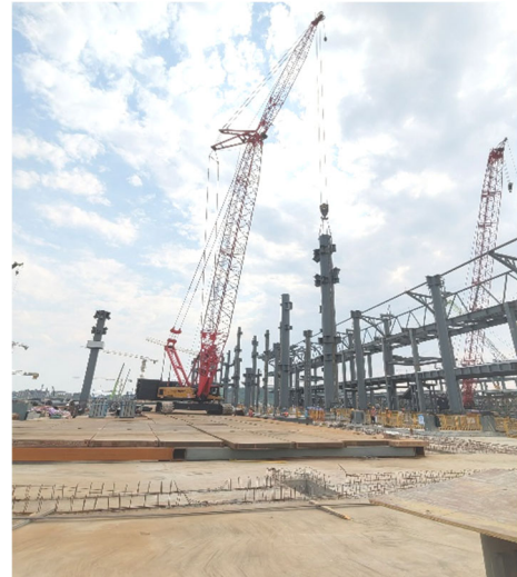
Figure 2. Subgrade box full