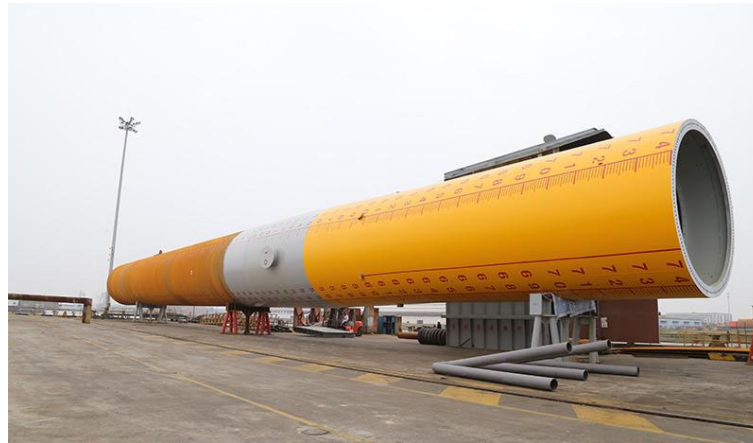
Figure 4. Typical large diameter single pile foundation of offshore fan

is ensured by anchoring foundation. At present, most offshore wind farms in China and Europe are located in offshore waters with water depths of less than 40 m. In this water depth range, large diameter single pile foundation, because of its simple structure, convenient installation, construction technology and equipment mature and stand out in the above various foundation forms, become the first choice of offshore fan foundation. At present, the single pile foundation of offshore fan is usually hollow steel pipe pile with diameter D=4-10 m, the ratio of pile depth to pile diameter L/D is mostly within the range of 3-10, and the wall thickness is 6-10 cm[3], [4].