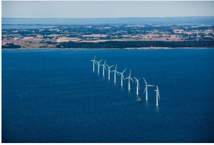
Figure 2. The world's first offshore wind farm - Vindeby Wind Farm in Denmark

annual electricity demand of 2200 households.