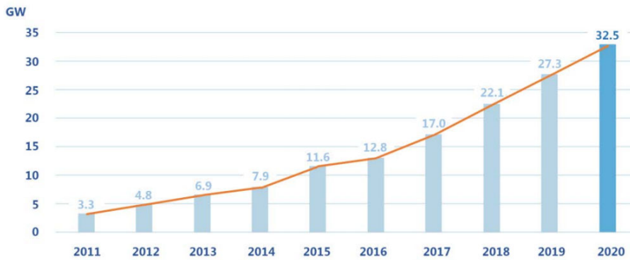
Figure 3. Global offshore wind power installed capacity trends