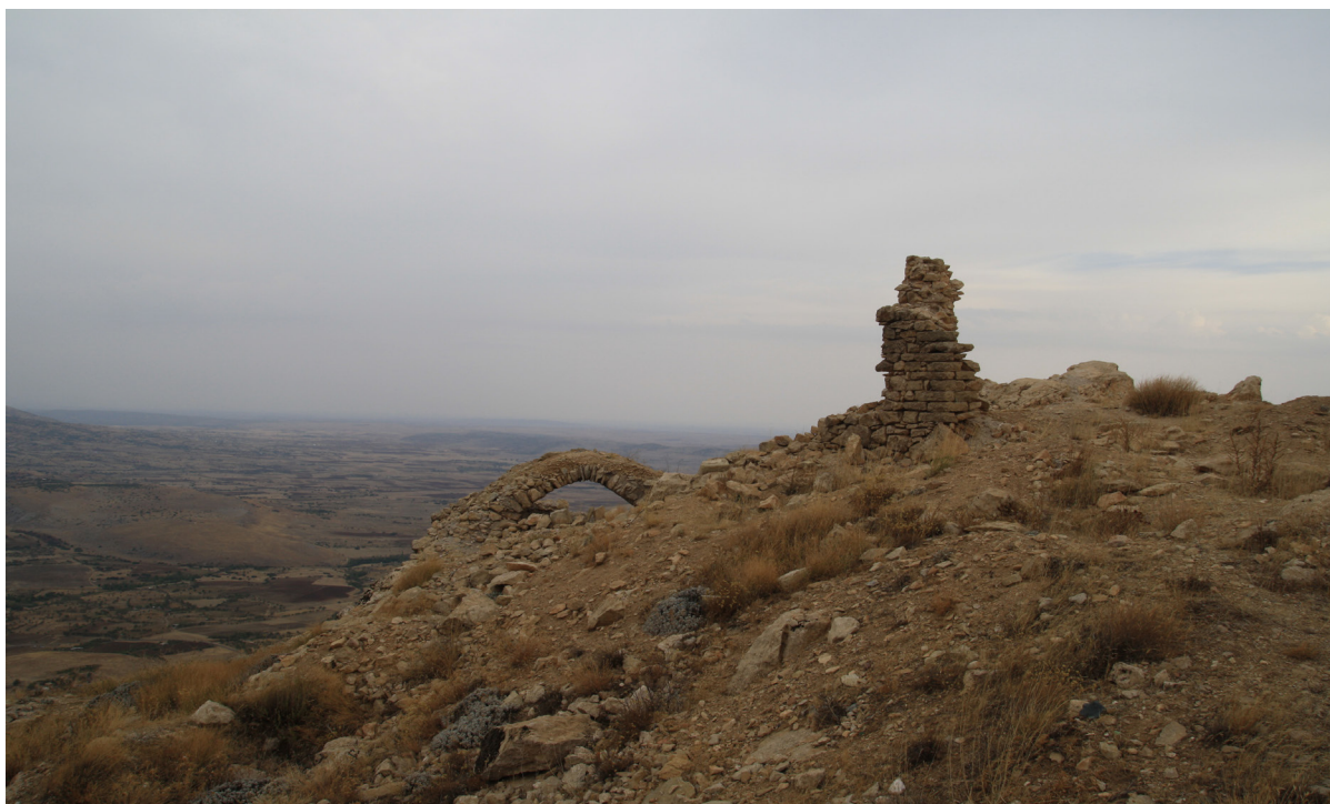
Fig. 2. The remains of the church of Saint Mary at the citadel of Ergani in 2018.

Little remains of this church today (see Fig. 2). 75 Nonetheless, a preliminary edition of the foundation inscription formerly displayed above the main entrance was published by Sruanjteanc', 76 which enables the following confident reconstruction: "This church was erected thanks to the support of God and according to the order of 'Uthmān khān during the holy episcopate of Mkrtič' Nalaš in the year 883 AE." 77 The difference between the date of 882 AE/1432–33 CE given for the foundation of the church in the commemorative note 78