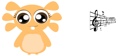
Figure 1: Example of screen in the Nonce Loanword Experiment.

picture of the favorite activity of the alien in question (only three possibilities were available: painting, sports, and music); see Figure 1. Participants were then instructed to say The [loanword] likes [depicted activity] . Participants took approximately 15 minutes to complete this experiment. The stimuli were recorded by a native speaker of American English with training in linguistics and phonetics.