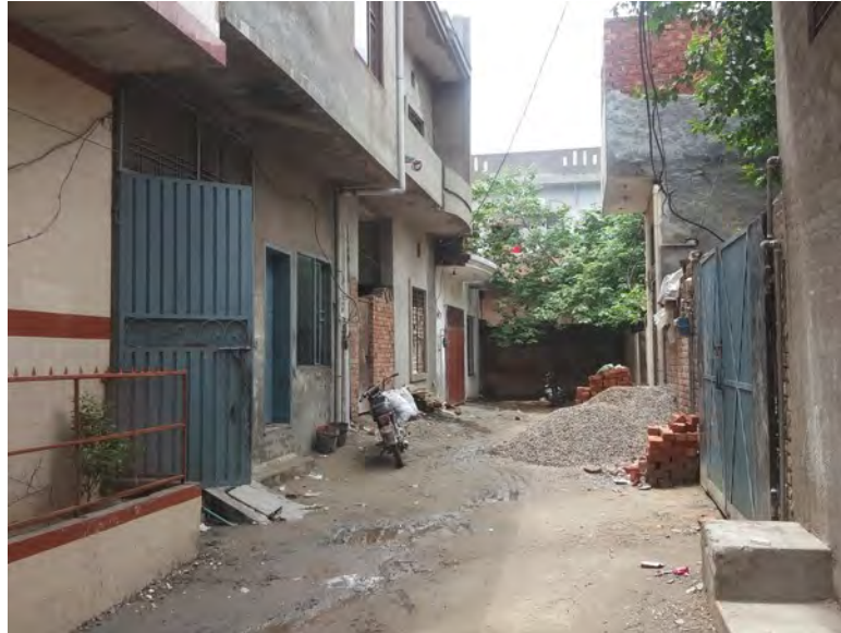
Figure 6. Recent Incremental House construction in Qalandar Pura

Tenants responded in clear positive figure towards the practice of incremental housing in squatter (Fig 6). In addition to this, more than 50% of the respondents acknowledged the exercise of house renovation as well. Since the squatter is already regularized one, so the response about house renovation after squatter up gradation was mixed one but more inclined towards disagreement.