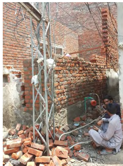
Figure 5. Incremental House construction in Badar Colony

Incremental housing is in full practice for badar colony which shows that once residents start living, they tend to live for longer time periods in most cases (Fig 5). House renovation also demonstrated positive response, however there are some groups of people who were not interested in it. Half of the respondents agreed that legalization of squatter will make majority of the community to go for renovation or incremental construction on basis of secure land tenure.