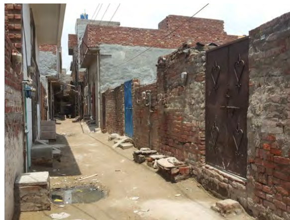
Figure 3. Alley view in Badar Colony

Tenants showed positive response towards the safe and secure environment of squatter. Active Community system was recorded as intergral part of this settlement. However, the hygienic conditions of badar colony were not satisfactory and tenants were not contented about it (Fig 3). On the other hand, due to strong community system, social issues were less such as kidnapping and robbery incidents which are considered to be common aspect of such informal settlements.