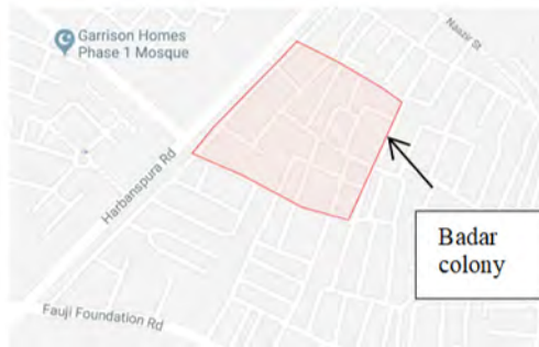
Figure 2. Google map for Badar Colony squatter

Badar Colony is illegalized squatter situated in Sadar near Ranger’s Head Quarter, Lahore on Harbanspura Road (Figure 2). Recent study described the squatter is an informal housing settlement with total of 1300 houses having population figure of 7800. There are two types of tenants here, some of them are urban settlers and other ones are the migrants from nearby suburbs, and villages. Ali Park, Jalal Town and Itthad colony are well-recognized areas near the selected squatter. Out of total population, only 2% have legal status of ownership while rest of the colony is living with unsecure tenure and ownership rights. Recent study revealed that people complain about corruption by official authorities for giving ownership rights and they charged more than RS.172/marla (According to katchi abadi act 1992) from residents of Katchi abadis; there are also some people who don’t even know the procedure of applying for ownership rights (Nasreen & Hira, 2009).