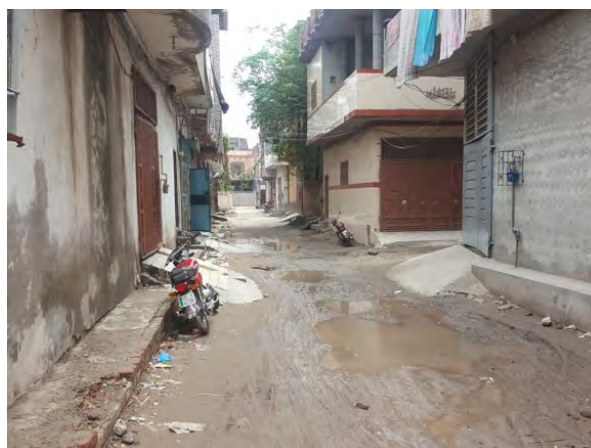
Figure 4. Alley view in Qalandar Pura, Source: Author

Safe and secure environment is merely a feature of such informal housing. However, people were satisfied with safety of environment to some extent. Most of them did not have the idea of safe environment as majority of them are not educated. This can also be linked with absence of active community system for addressing such issues. As a result, hygienic conditions were also not better here (Fig 4). According to the results, kidnapping and robbery activities had not been witnessed by the respondents.