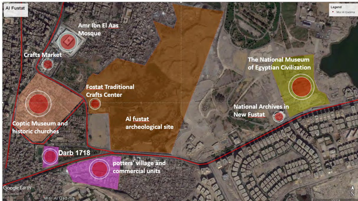
Figure 5. Al Fustat area cultural mapping (The researcher)

Realizing the opportunity: which consider in broad terms the full range of the cultural resources as well as its interrelation with the physical environment as a milieu. In this phase, all conditions, issues, and needs should be identified in the local area concerned. Cultural mapping is the prime identification of the cultural features in the designated area. Mapping is a tool for pinpointing creative and cultural assets. The focus of mapping is to compile information of cultural resources that support decision-making and planning in cultural development or revitalization.