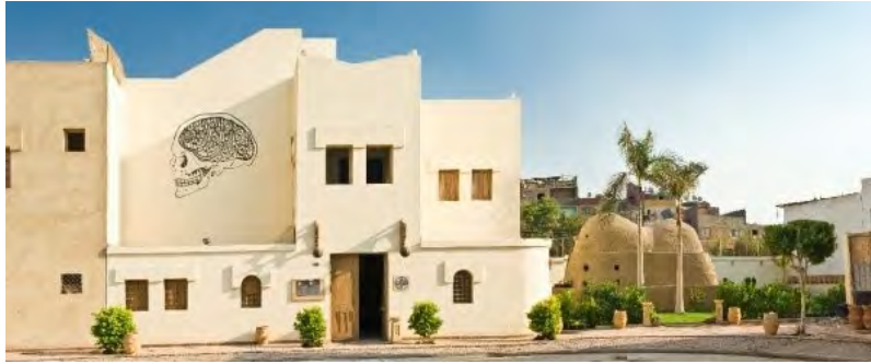
Figure 3. Darb 1718 a cultural venue, Source: http://www.darb1718.com/darb1718/

Al Fustat- old Cairo is showing another opportunity to invest in culture for the sake of developing the whole district. The case here is providing many cultural venues but needs more physical interventions to positively change and align the public realm with the cultural offerings of the place.