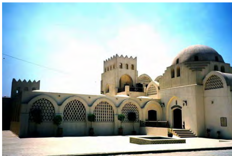
Figure 2. Fustat Traditional Crafts Center, Source: https://archnet.org/sites/5065

The realization of the cultural significance of this area of the City has attracted the attention of the non-governmental bodies to contribute to providing another venue to the area. Darb 1718 is a non-governmental organization founded in 2008. It provides different types of spaces for a variety of cultural and artistic events. Darb 1718 has one theater, two exhibition halls, stages, open-air cinema, outdoor spaces in addition to the residential part to offer accommodation facility for guest and artists coming from abroad. The center offers different artistic workshops, cultural events, and training programs for young artists and provides them with spaces to display their work together with professional artists. It involves the Egyptian creative class with the local and international art and culture field. Darb 1718 is the gathering point and a platform for displaying Cairo's Contemporary Art.