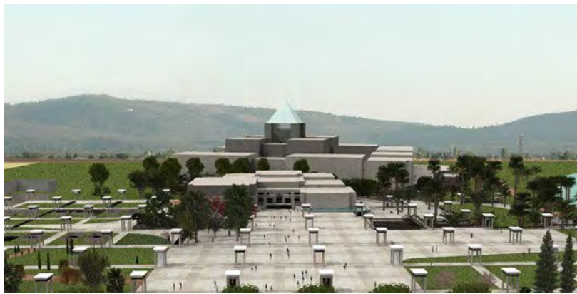
Figure 1. The National Museum of Egyptian Civilization NMEC

The NMEC is the first museum of civilization in Egypt is also located in the district, overlooking the Ain El-Seera Lake. The NMEC is planned to display the Egyptian civilization through different eras from prehistoric times to the present day and highlight the country's tangible and intangible heritage.