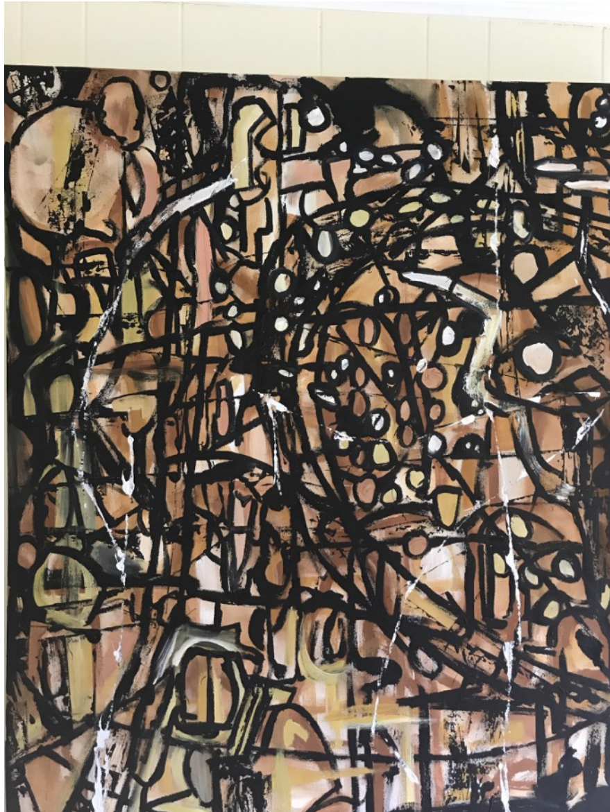
Figure 3 Untitled April 2019