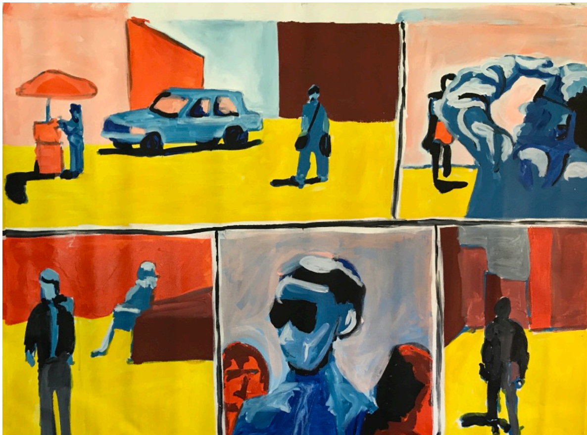
Constructing a Pedagogy of Apparentness