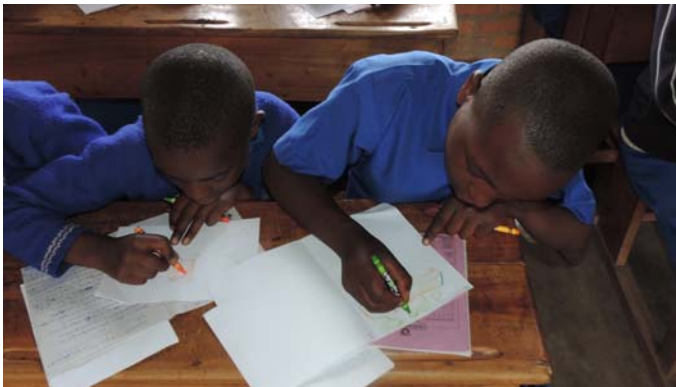
Kabwende Primary School students working on their illustrations for The World Is Our Home, Volume 9 .