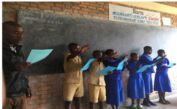
A Readers Theatre class practicing their dialogues together in front of the class.