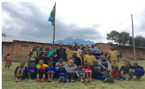
Indiana University and Kabwende Primary School students celebrating the completion of the Play360 playground.