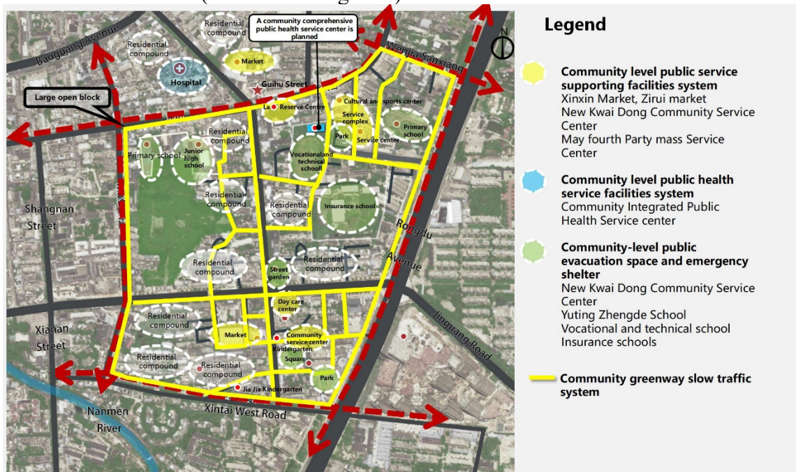
Figure 4 spatial system of three level cities: big open block, middle prevention and control residential area and small isolated group

(community comprehensive public health service center), Community level public evacuation space, emergency shelter (New Guidong community service center, Yuting Zhengde school, vocational and technical school, insurance school, etc.). Daily, around the basic elements of public services; During the period of major disasters and infectious diseases prevention and control, disaster prevention and medical care are the center (as shown in Figure 4).