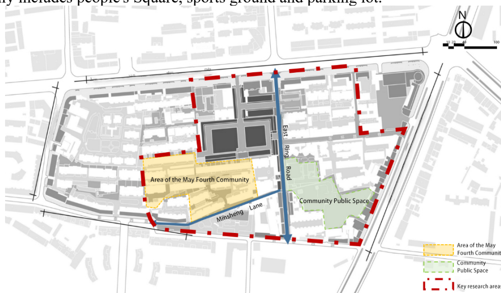
Figure 1 research scope and current situation of new Guidong area

This project is mainly for the community construction planning of Xinguidong community in Guihu street of Xindu District in the next three years. The community scope extends to Rongdu Avenue in the East, Shengyuting Lane in the West, Guihu East Road in the North and Xintai West Road in the South, covering an area of about 87 hectares. The key research scope of this project is shown in Figure 2. The current public service facilities in the study area include the sports complex transformed by the old court, the May Fourth Party mass activity center, day care, Tianfu home, etc.; The current schools mainly include Jiajia kindergarten and other kindergartens; The current open space mainly includes people's Square, sports ground and parking lot.