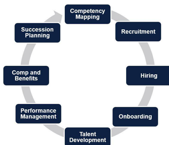
Figure 2. Talent information integration management network structure system

professional basic courses, public basic courses, professional core courses and innovative entrepreneurship courses. Supported by professional basic courses and public basic courses, we pay attention to the cultivation of students' professional ability, cultural accomplishment, beneficial learning quality and sustainable development ability, and lay the foundation for students' high-quality employment and career development. Under the premise of the continuous development of society, there is an increasing demand for pharmaceutical talents in China, and the cultivation of pharmaceutical professionals in vocational school cannot be attached to the traditional training mode. We should constantly improve the construction of the teaching curriculum system, and fundamentally strengthen its humanistic quality [10]. The cultivation of professional skills and professional ethics can fundamentally strengthen the moral consciousness of medical professionals. Figure 2 shows the network structure system of talent information fusion management.