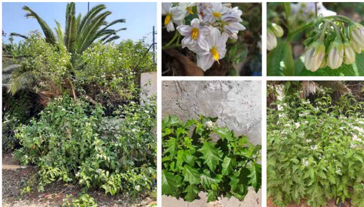
Fig. 1. Solanum bonariense L., Oran (NW-Ageria), July 2025

Jijel (36°49'22" N, 5°45'41" E). A roadside