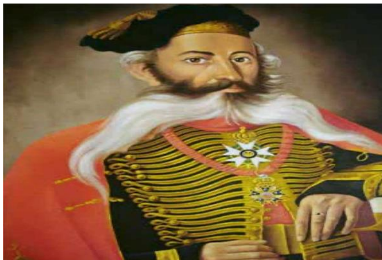
Jean Francois Allard,

Jean Francois Allard, a French officer, joined the service of the Maharaja with his companion Ventura in 1822.