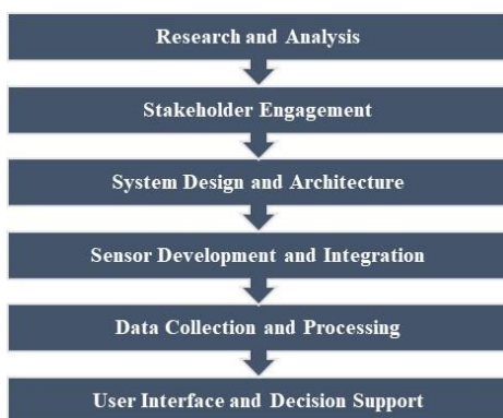
Fig 3 Proposed work