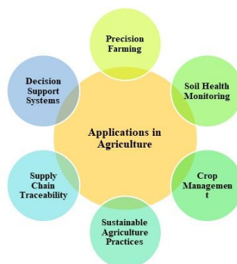
Fig 2 Applications in Agriculture

IoT-powered soil health detection systems in agriculture provide transformational answers to sustainable food production, environmental conservation, and agricultural sustainability.