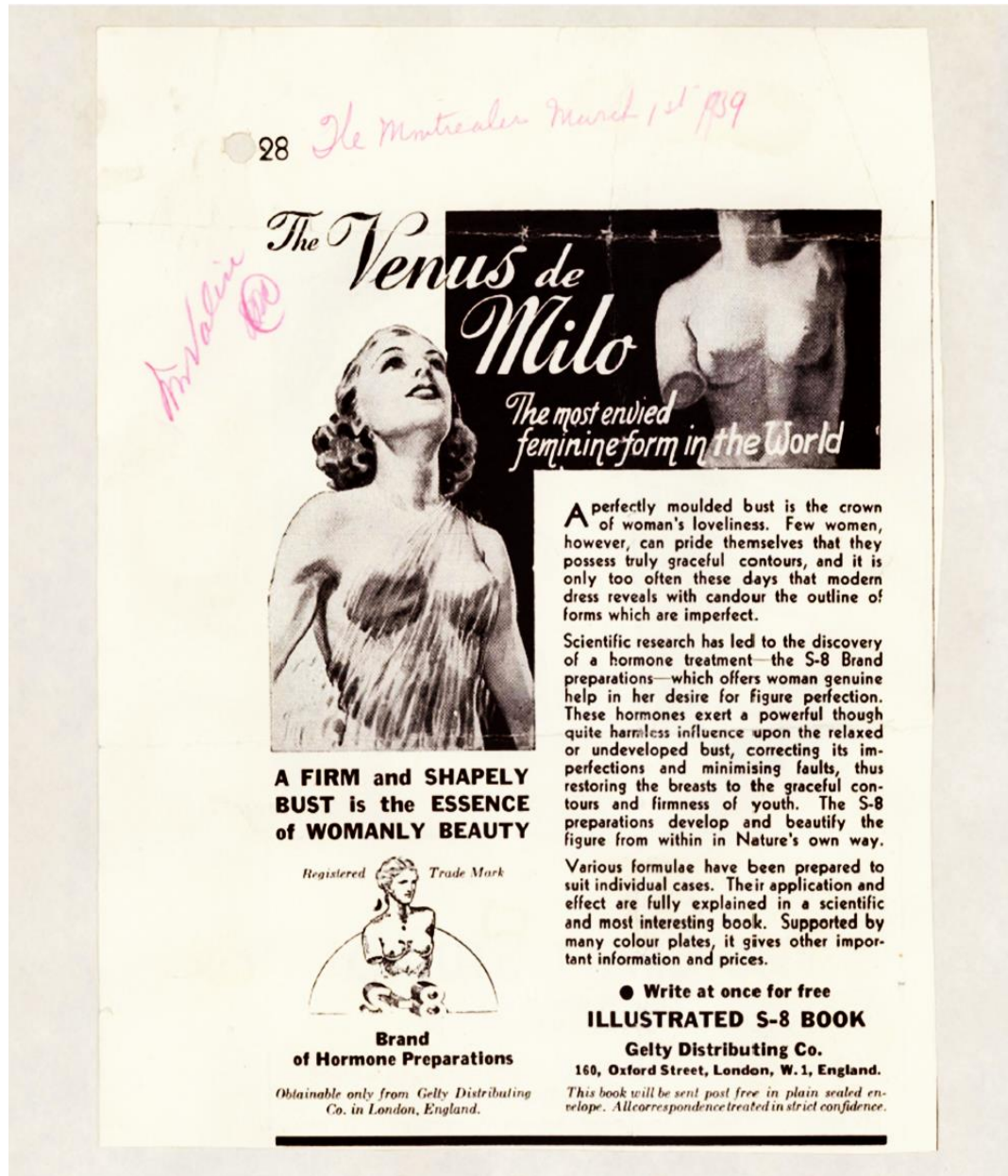
Figure 1. Advertisement for S-8 Brand of Hormone Preparations, 1 March 1939. Library and Archives Canada, RG 29, volume 258, file number 347-1-6 (Part 2), reproduction copy number e-011195705.