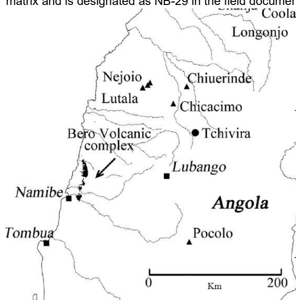
Figure 1: Location of the Bero volcanic complex in Eastern Africa.

The sample used in this study was provided by iLamir (Mineral and Rock Analysis Laboratory – Federal University of Paraná, Brazil). It was collected from an outcrop in the Bero volcanic complex, located in Namibe Basin, southwestern Angola (Figure 1). The sample under analysis is a basalt rock characterized by a crystalline matrix and is designated as NB-29 in the field documentation.