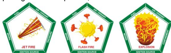
Figure 1: Consequences of ignition, based on the pentagon of fire

For the analysis of the consequences, among all the aspects to be taken into account, the starting point is the pentagon of the explosion, in order to understand the physical effect resulting after the ignition.