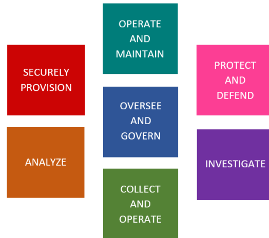
Fig. 2. NICE Framework Categories

organizations in meeting cybersecurity workforce development goals. The NICE Framework establishes a taxonomy and common lexicon that describes cybersecurity work and workers irrespective of where or for whom the work is performed. Fig. 2 shows the categories upon which the NICE framework is built. The rest of this paper will explore the areas in which students excelled or fell short of solving anomalies that mapped to the NICE Cybersecurity Workforce Framework.