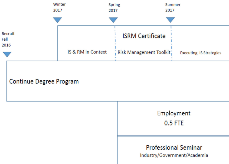
Figure 4: Cybersecurity Cooperative Learning Pilot

Application of the Cybersecurity Professional Readiness Model (CPRM) could be applied as a measuring instrument and can guide careers toward preparation for positions at the operating, managerial or executive levels, as well as identify gaps in preparedness, so that they can build plans to eliminate and compensate for any deficiencies. This is both a tool for selection and continuous guidance. 8