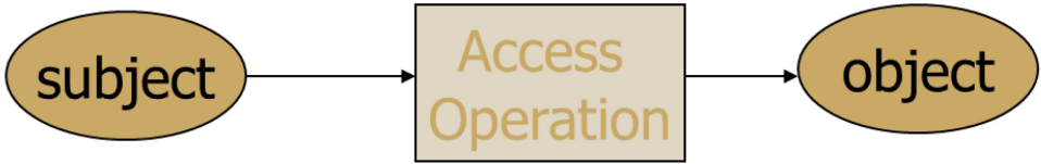
Figure 2: Three tuples in access control

Discretionary access control (DAC) is a popular mechanism that oversees access to data objects (files, directories, etc.) and which users are permitted to resources based on the system identity. Explicit access rules are established about who can, or cannot, execute which actions on which resources. The “discretionary” part means that users can be given the ability of passing on their privileges to other users, where granting and revocation of privileges is regulated by an administrative policy. An Access control matrix is an abstract model of DAC and the state of the system is defined by a triple (S, O, A) where S means subjects, O means objects, and A means access matrix. As you can see, there are a lot of options for variation in terms of configuring system identities.