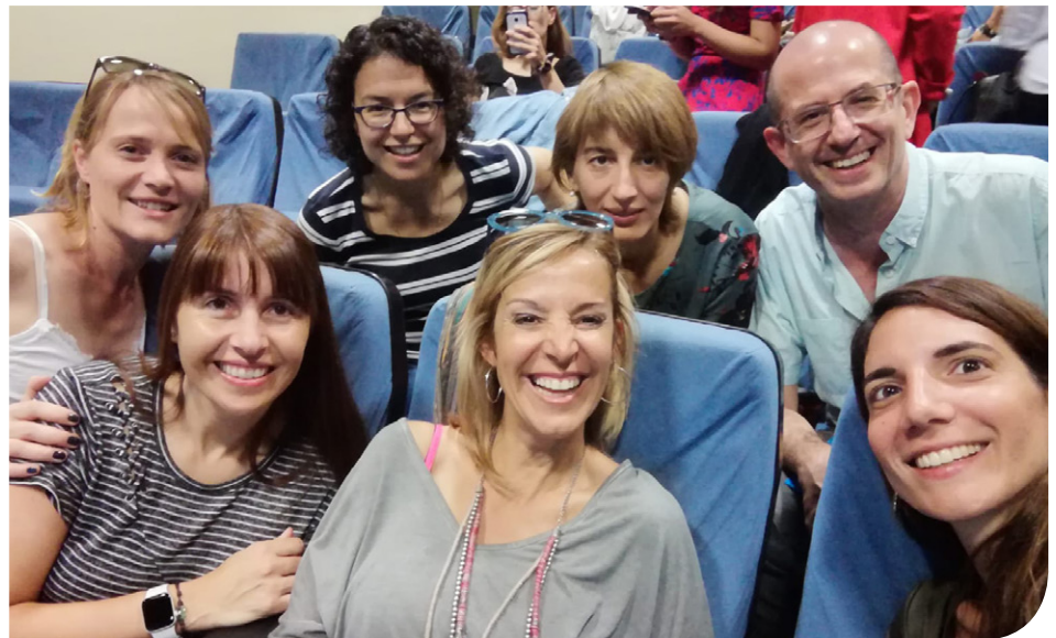
Barcelona NIDCAP Team

Collaboration is likely the key word that best defines us as a center. Collaboration is one of the main values of our activity. Our challenges include the lack of time and financial resources, and perhaps this is a reason that has helped us to take part in some collaborative projects. Some of our projects are listed below, as they may serve as inspiration for other teams: