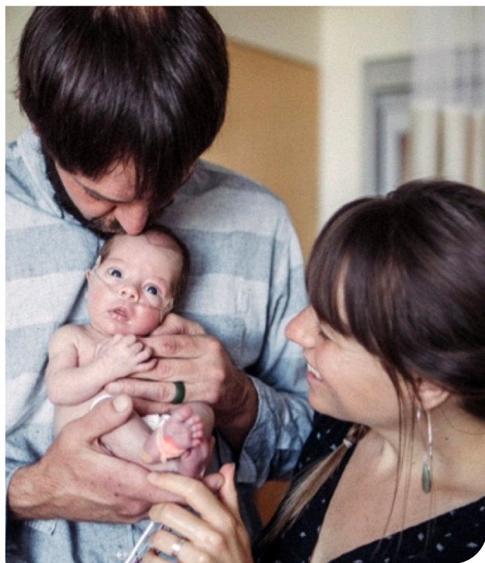
Nearing the end of our NICU journey at 40 weeks.

The baby inside of me, which we had yet to know was a boy or a girl, was quite the acrobat. Our baby moved predictably, and I could trust that around 7:30 each evening I would feel a fury of movement. I will always be so grateful for this predictability, as it is one of many things that would come to save the life of our sweet baby girl. Come Thursday evening, I didn't feel the baby move as I typically would, but I did feel a series of irregular Braxton Hicks contractions. I assumed that the lack of fetal movement was simply replaced by another typical sensation. The next day, while remote teaching on Zoom (video conferencing), I recall pausing to notice and wonder what was keeping my baby so quiet, as I had yet to feel any noticeable movement that day. While I knew that fetal movement often decreased later in term, I nevertheless felt unsettled about the lack of motion. Something didn't feel right. The day went on as I played mental ping pong, alternating between feeling as if I was being overly dramatic, and then feeling genuinely concerned. Come nine pm that night, after trying everything Google told me to-- jumping jacks, chocolate milk, a bright light, talking loudly, glass after glass of