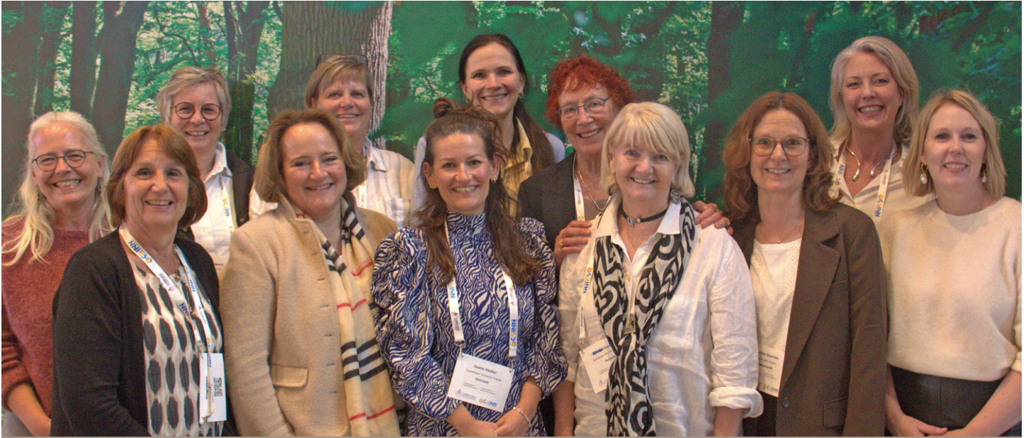
NIDCAP Professionals and Trainers at the COINN Conference

focused topics. These were consistent with the conference themes and reinforced the focus of the NIDCAP Federation International (NFI).