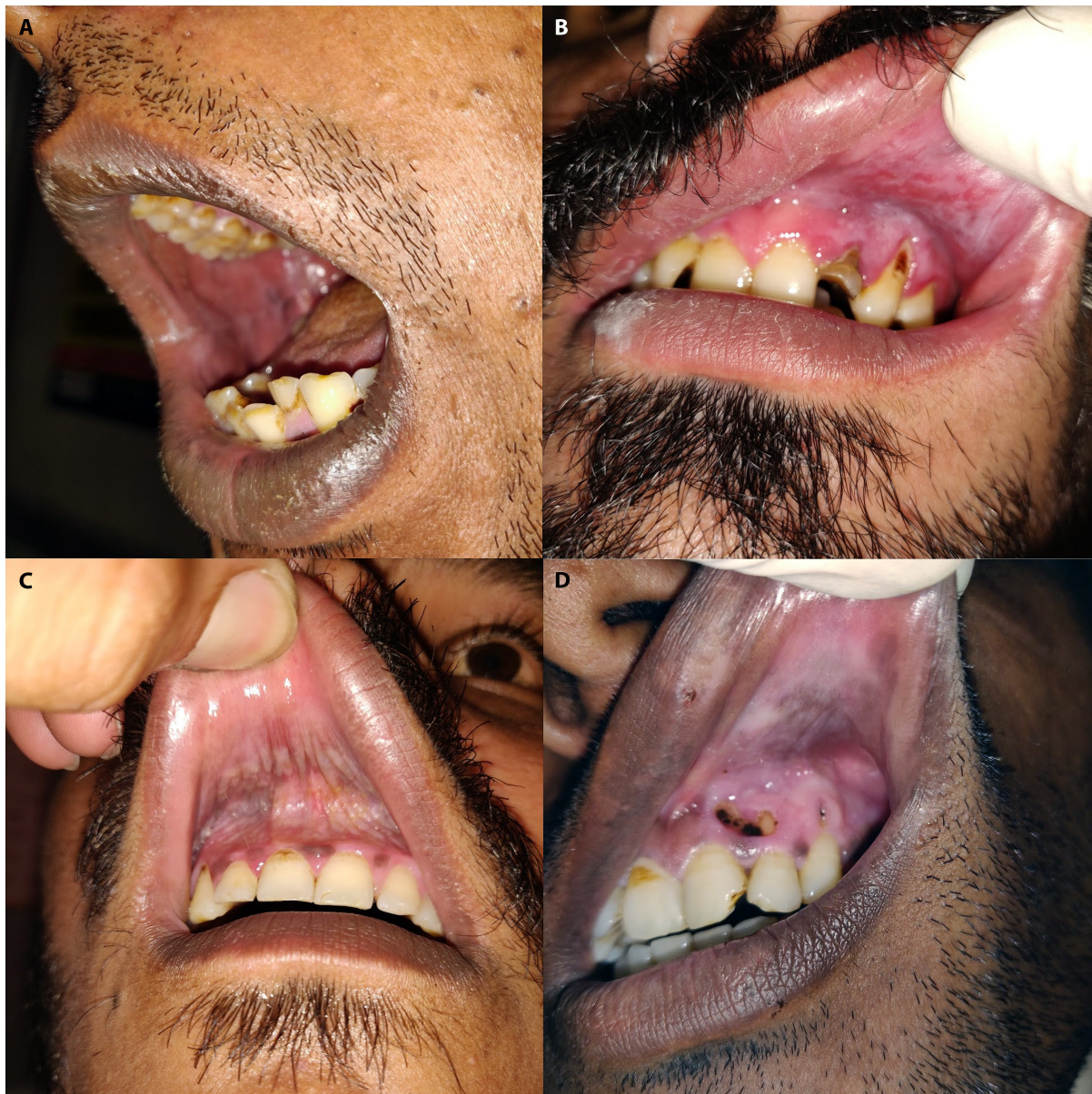
Figure 4. (A) Oral cavity pigmentation with caries teeth. (B) Cobble-stoning of gingivolabial sulcus with erosions. (C) Submucosal fibrosis with leukoplakia. (D) Gingivolabial mucosal fibrosis with ulceration.

cobble-stoning which tend to be premalignant conditions and may lead to drastic situations if not addressed accordingly (Figure 4).