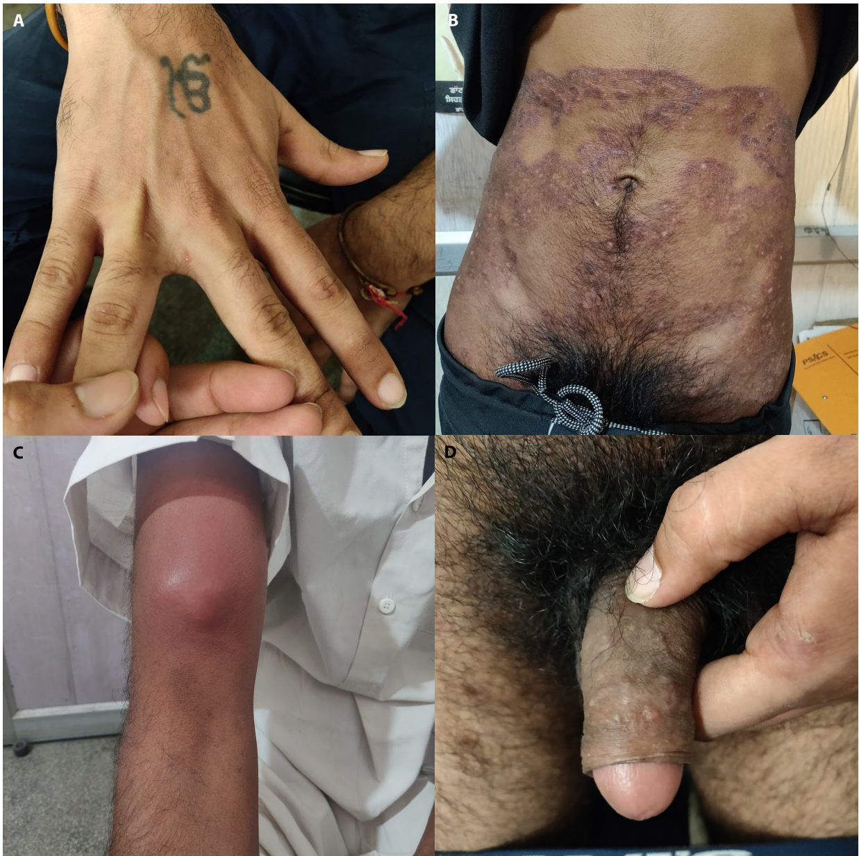
Figure 3. (A) Scabies mite burrows. (B) Extensive TineaCorporis. (C) Soft tissue swelling of arm (patient was T1 DM). (D) Herpes genitalis.

The oral cavity is yet another area to be stressed upon in IDUs as they tend to be smokers, alcoholics, and tobacco abusers with poor oral hygiene and the degree of neglect they have may pose drastic effects such as oral malignancies [22,23]. The changes observed in our studies included pigmentation related to nicotine and depigmented patches too can be toxic reactions to the melanocytes. The gingivobial mucosa was the most exploited area in the oral cavity due to the habit of keeping the tobacco pouch undersurface of the lip and most patients had pigmentary changes, erosions, and submucosal fibrosis and few had leukoplakia and