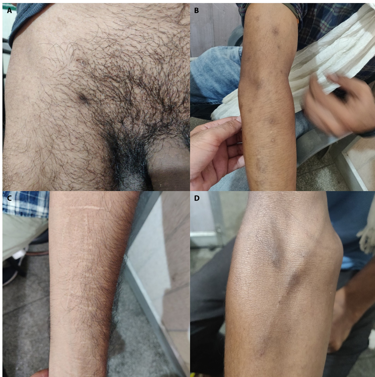
Figure 1. (A) Multiple depressed scar marks over inguinal region. (B) Skin popping marks. (C) Hesitation marks. (D) Track marks.

Viral disease transmission is common among IDUs due to sharing of syringes due to which there is an increased rate