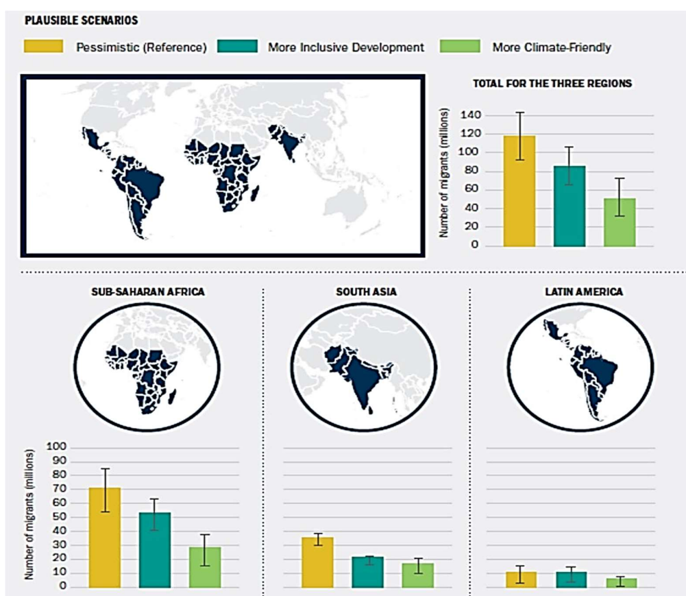
Figure 1.5.2. Possible environmental migration scenarios in 2050 [19]

For example, Figure 1.5.2 presents the possible scenarios for 2050 for the regions of sub-Saharan Africa, South Asia and Latin America in terms of people displaced by climate change, which is one of the consequences of environmental degradation.