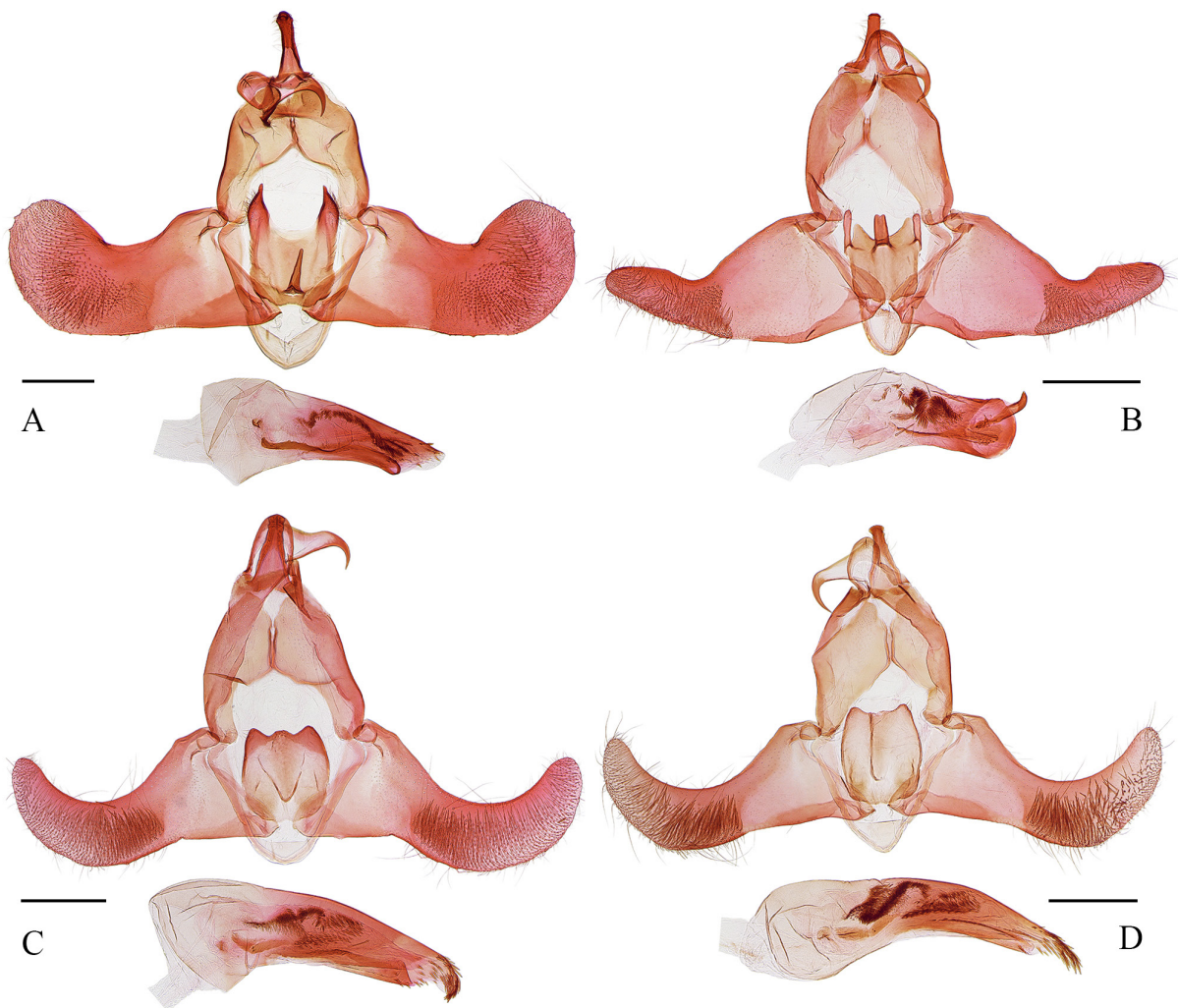
Fig. 3. Male genitalia of Thubana spp. A. Th. circularis Park, 2006 (slide no. YS19766, NKU). B. Th. fangensis Park, 2003 (slide no. YS19774, NKU). C. Th. felinaurita Li, 2010 (slide no. YS19767, NKU). D. Th. porcata sp. nov., holotype (slide no. YS20169, NKU). Scale bars = 0.5 mm.

The specific epithet is derived from the type locality.