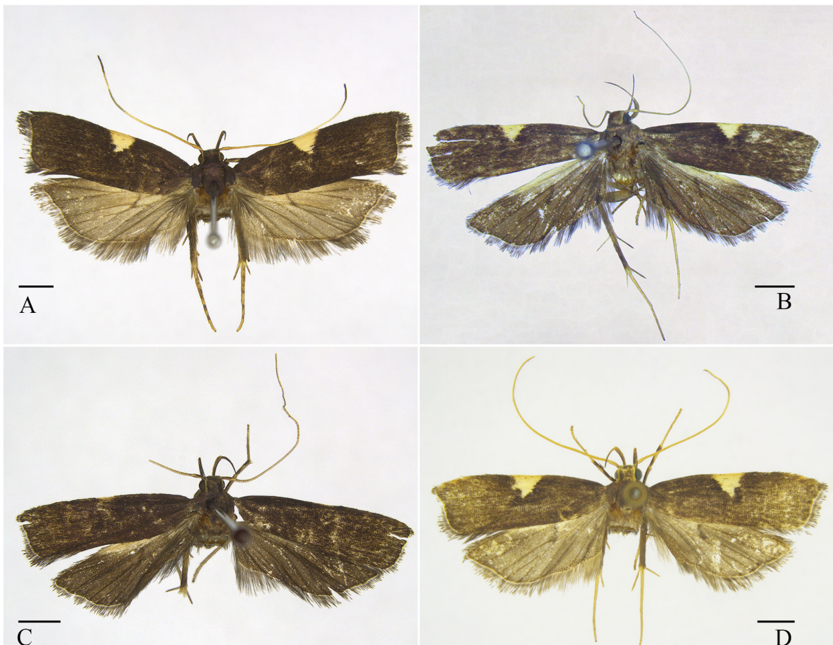
Fig. 2. Dorsal habitus of Thubana spp. A. Th. quadrilatera sp. nov., holotype, ♂ (slide no. YS19773, NKU). B. Th. rongjiangensis sp. nov., holotype, ♂ (slide no. LCU009, LCU). C. Th. similidalgona sp. nov., holotype, ♂ (slide no. YS20211, NKU). D. Th. yingjingensis sp. nov., holotype, ♂ (slide no. LCU198, NKU). Scale bars = 2.0 mm.

The specific epithet is derived from the Latin ‘ porcatus ’, referring to the vertical ridge on the juxta of the male genitalia.