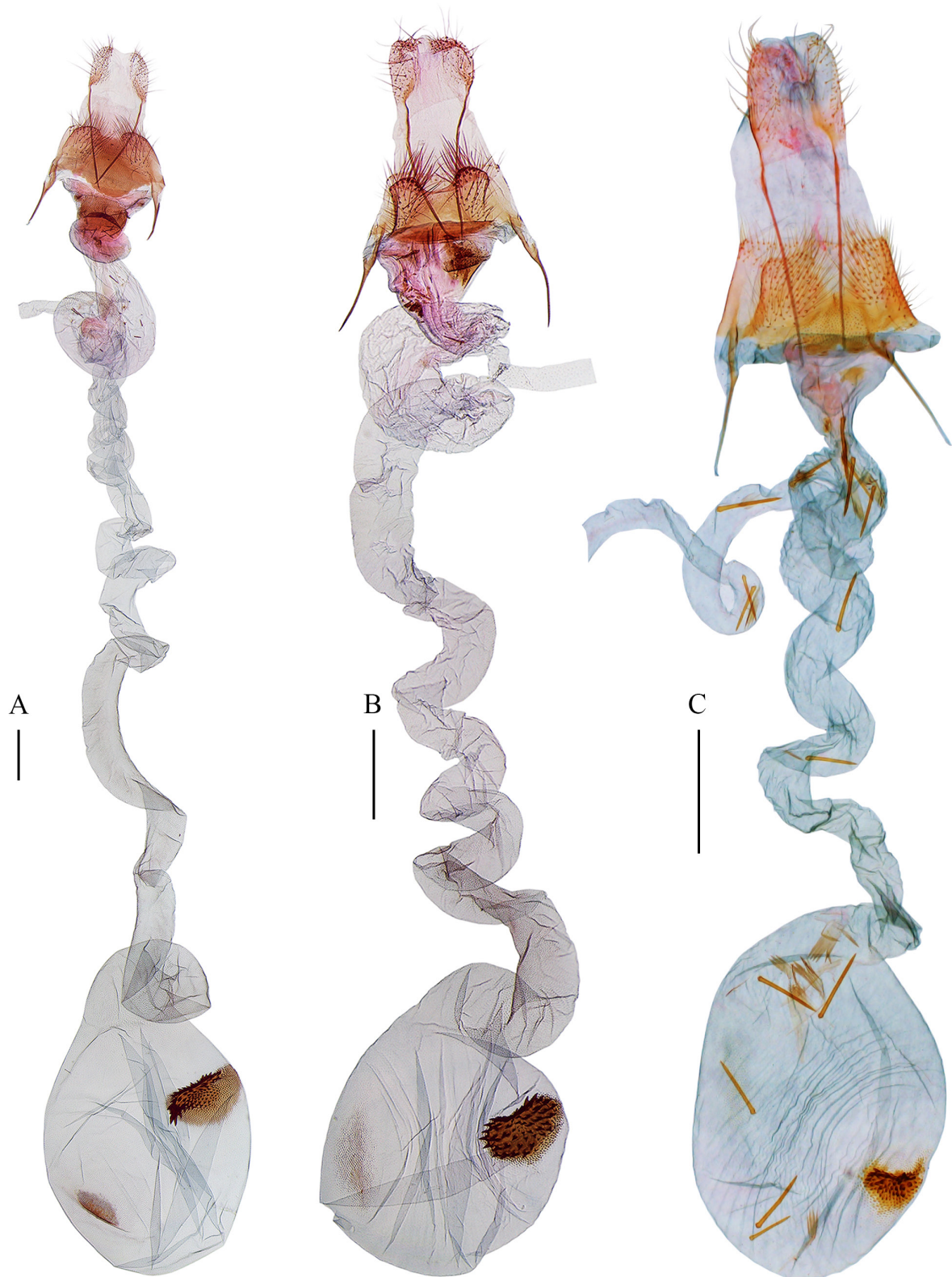
Fig. 6. Female genitalia of Thubana spp. A. Th. porcata sp. nov., paratype (slide no. YS20300, NKU). B. Th. quadrilatera sp. nov., paratype (slide no. YS20294, NKU). C. Th. virabilis sp. nov., paratype (slide no. YUS184, NKU). Scale bars = 0.5 mm.