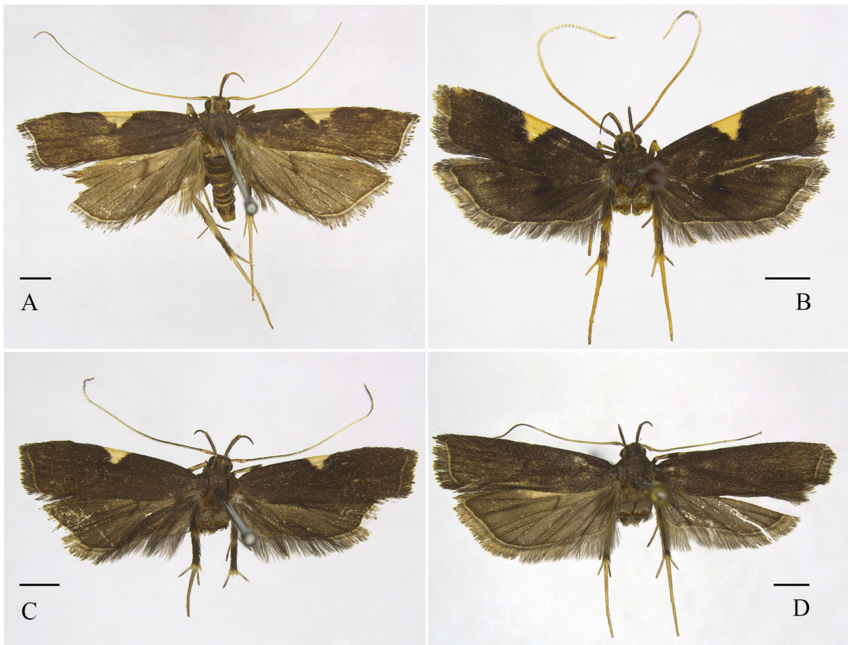
Fig. 1. Dorsal habitus of Thubana spp. A. Th. circularis Park, 2006, ♀ (NKU). B. Th. fangensis Park, 2003, ♀ (slide no. YS19775, NKU). C. Th. felinaurita Li, 2010, ♀ (slide no. YS20303, NKU). D. Th. porcata sp. nov., holotype, ♂ (slide no. YS20169, NKU). Scale bars = 2.0 mm.

The species was described based on two males, and we herein describe the female for the first time.