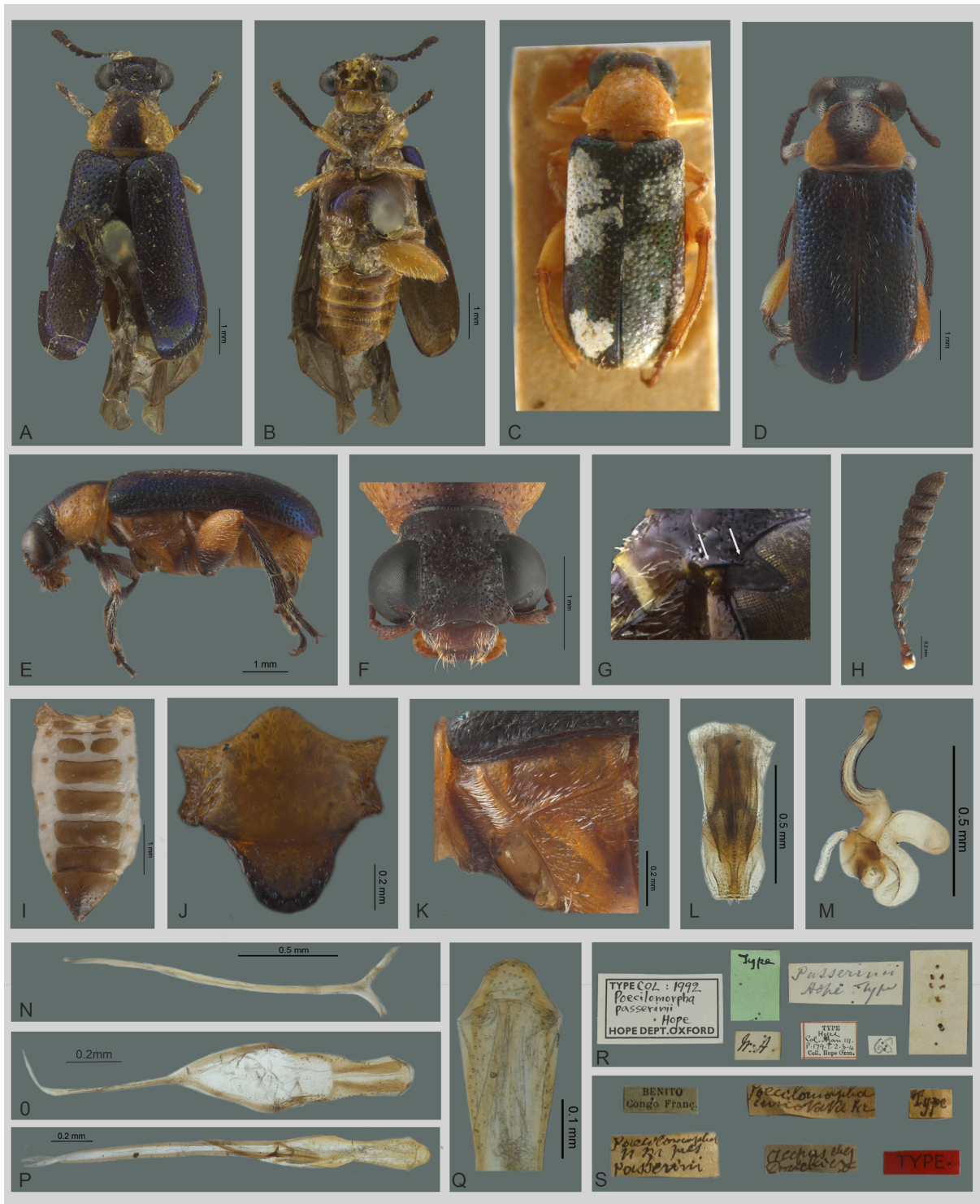
Fig. 2. A–B, R. Poecilomorpha passerinii Hope, 1841, syntype, ♂ (OUMNH). A. Dorsal view. B. Ventral view. C. Poecilomorpha innotata Pic, 1946, syntype, sex? (MNHN), dorsal view. D–Q. Poecilomorpha passerinii Hope, 1841. D–K, N–Q. ♂ (MNHN). L–M. ♀ (MNHN). D. Dorsal view. E. Lateral view. F. Frontal view. G. Margin of the antennal awning. H. Antenna. I. Dorsal abdomen view. J. Mesoscutum. K. Metaepisternum. L. Sternite VIII female. M. Spermatheca. N. Spiculum gastrale. O. Tegmen. P. Middle lobe. Q. Middle lobe apex. R–S. Type labels.