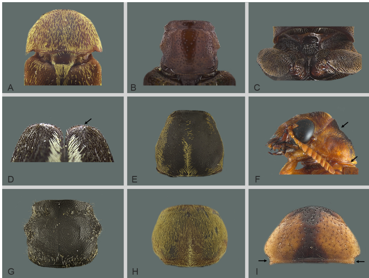
Fig. 1. A. Pronotum of Monrosolopha tarsata (Bryant, 1941). B. Pronotum of Bryantonaria crampeli (Pic, 1913), syntype, ♂ (MNHN). C. Mesoventrite pit of B. crampeli , ♂ (MNHN). D. Crenate elytral edge of Antonaria sp. E. Pronotum of Antonaria sp. F. Pronotum lateral view of Falsocolobaspis elongatus Pic, 1951, ♂ (RMCA). G. Pronotum of Piomelopus flabellicornis (Jacoby, 1895), ♂ (MNHN). H. Pronotum of Sphondylia sp. I. Pronotum of Poecilomorpha passerinii Hope, 1841, ♂ (MNHN).