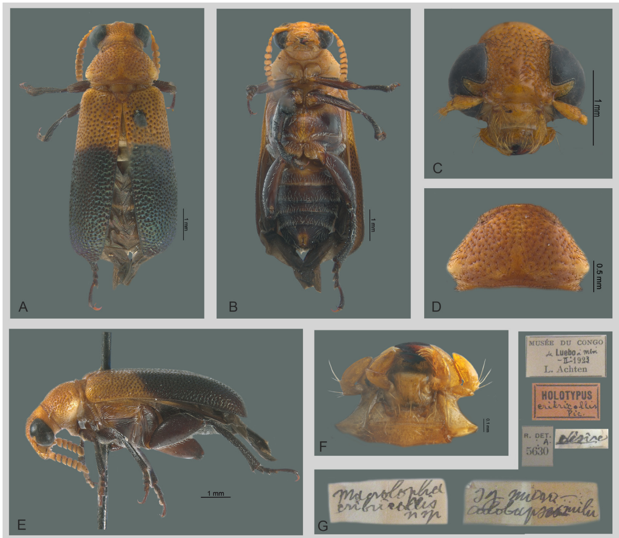
Fig. 4. Poecilomorpha cribricollis , holotype, ♂ (RMCA). A. Dorsal view. B. Ventral view. C. Frontal view. D. Pronotum. E. Lateral view. F. Maxillary and labial palps. G. Type labels.

DEMOCRATIC REPUBLIC OF THE CONGO • ♂; “MUSÉE DU CONGO, de Luebo á Mboi, -II:1923, L. Achten / R. DET., A, 5630/ HOLOTYPUS cribricollis Pic / desire / Macrolopha cribricollis n sp / sg Micro colobaspis mihi”; RMCA.