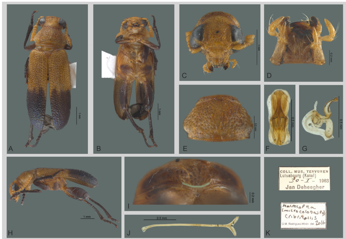
Fig. 5. Poecilomorpha pseudocribricollis . sp. nov., holotype, ♀ (RMCA). A. Dorsal view. B. Ventral view. C. Frontal view. D. Maxillary and labial palps. E. Pronotum. F. Sternite VIII. G. Spermatheca. H. Lateral view. I. Metaventrite. J. Spiculum gastrale. K. Type labels.

HEAD. Occiput coarsely punctate; interocular space coarsely and densely punctate, with long brown pubescence, interspaces smooth, same wider than puncture diameter (Fig. 5C); frons convex, impunctate, glabrous; surface of ocular canthus convex; margin of the antennal awning prolonged onto canthi; length of antennae not exceeding pronotal posterior edge; scape 2.7\times as long as antennomere III; III longer than VI; V and VIII as long as wide; VI, VII, IX and X wider than long; frontoclypeal groove straight (Fig. 5C); last labial palpomere bullet-shaped, apex blunt; last maxillary palpomere bullet-shaped, apex blunt (Fig. 5D).