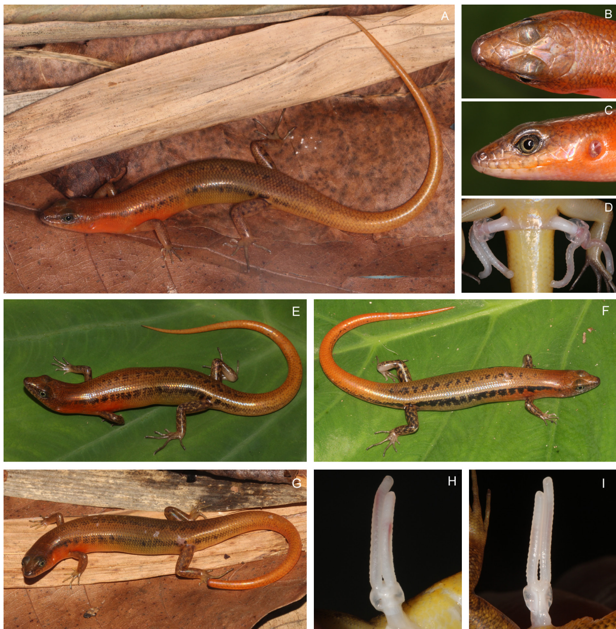
Fig. 4. Scincella auranticaudata sp. nov. A–D. Holotype, ♂ (ITBCZ 7700). A. General view in life. B. Dorsal view of the head. C. Lateral view of the head. D. Everted hemipenes. E. Paratype, ♀ (ITBCZ 6527), in life. F. Paratype, ♀ (ITBCZ 7623), in life. G–I. Paratype, ♂ (ITBCZ 7620). G. General view in life. H–I. Everted hemipenis.

Head scales smooth; rostral convex, distinctly visible from above, in broad contact with frontonasal; no supranasals; prefrontals well separated from one another; four supraoculars; frontal narrowing posteriorly, longer than wide (3.8 mm vs 2.2 mm), longer than its distance from snout (2.5 mm),