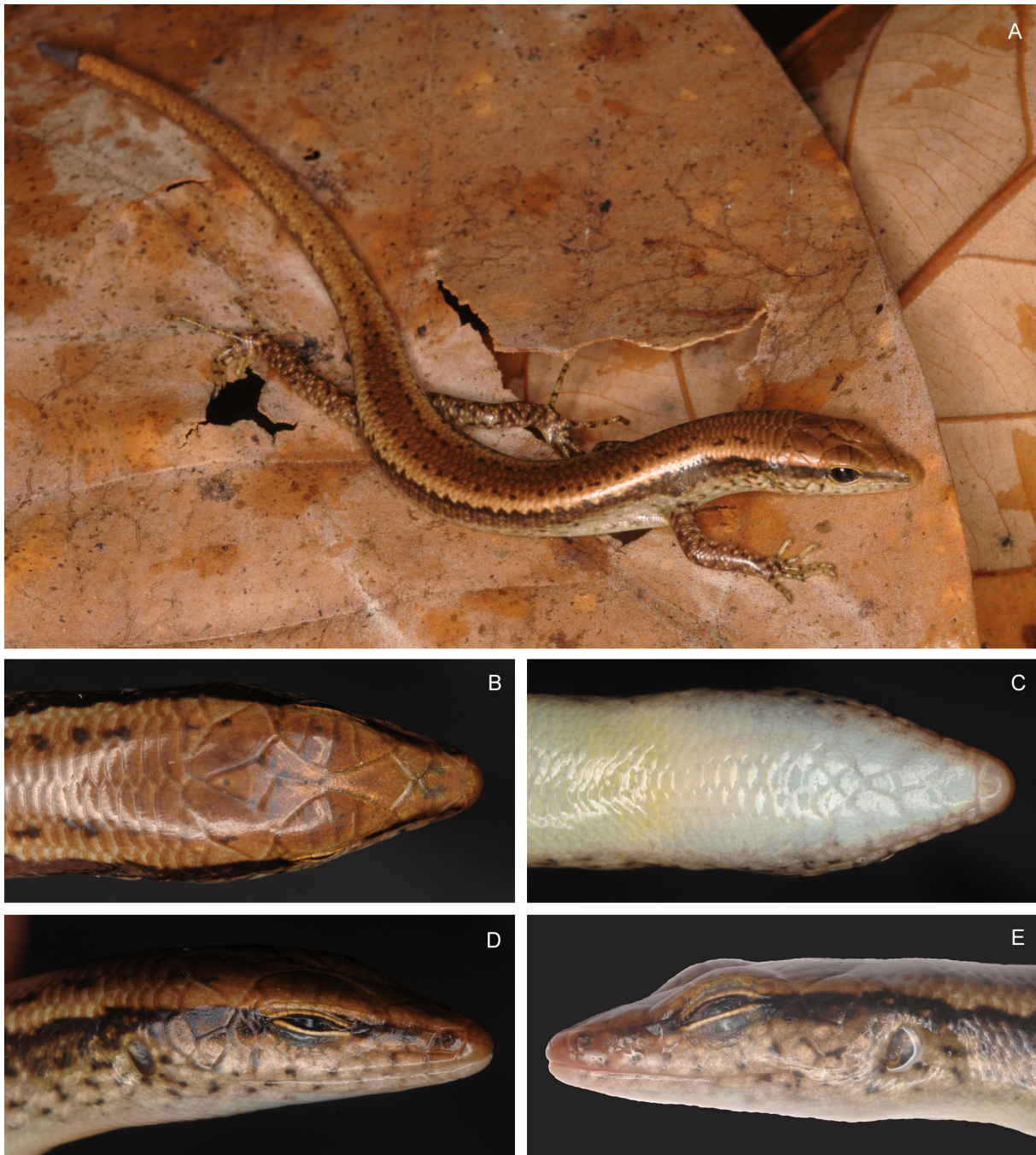
Fig. 3. Scincella honbaaensis sp. nov., holotype, ♂ (ITBCZ 4679). A. General view in life. B–E. Dorsal, ventral, and lateral views of the head, respectively.

lower eyelids orange to yellow; eye immaculate black. In preservation, color fades but pattern remained with two longitudinal black dots on dorsum and sparse black dots on lower part of side; overall dorsal and lateral coloration light brown; venter cream. Morphological characters of the holotype were summarized in Table 3.