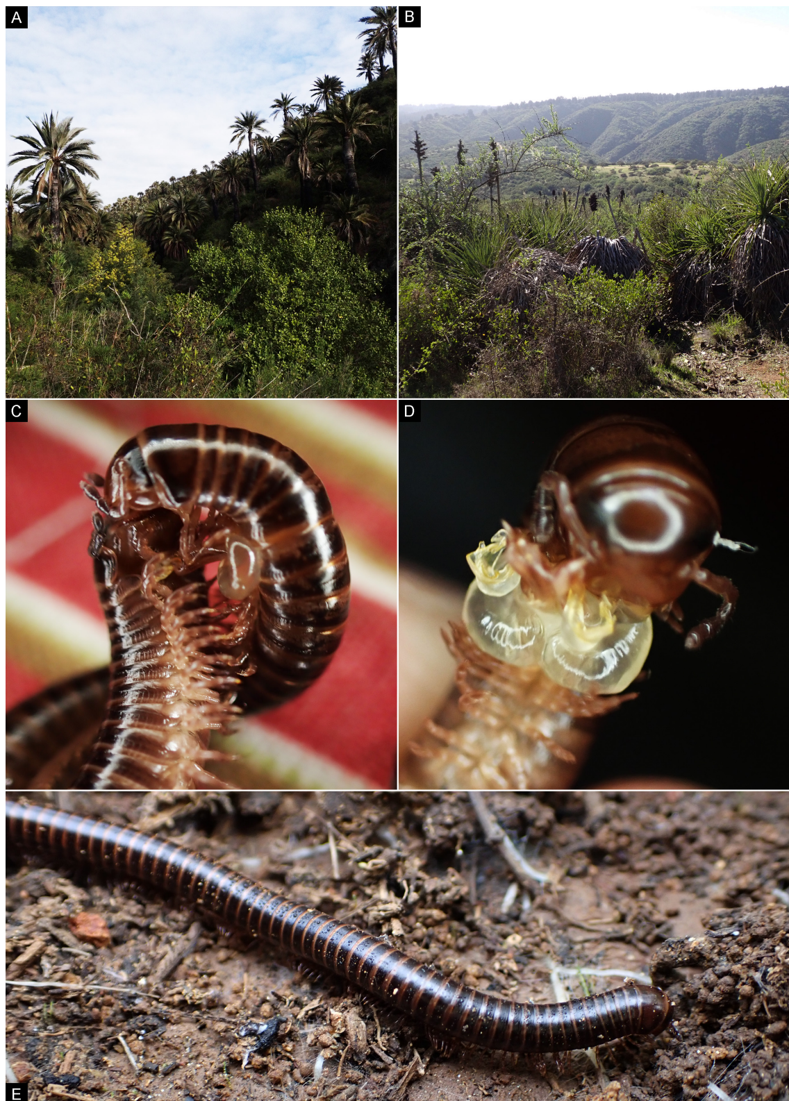
Fig. 2. Collecting sites and living specimens of Autostreptus chilensis (Gervais, 1847). A. Jubaea chilensis (Molina) Baill. palm groves with undergrowth of sclerophyllous forest near El Salto. B. Coastal sclerophyllous forest in Parque Natural Gómez Carreño. C. A couple mating. D. Male in ventral view, showing inflated gonopod pouch during mating. E. Habitus of a living male specimen.