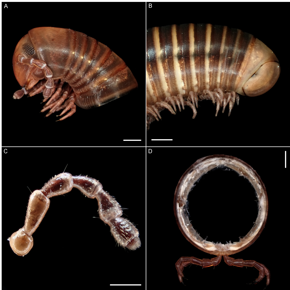
Fig. 4. Autostreptus chilensis (Gervais, 1847), ♂ (PG-34-VAL, MNHNCL). A. Head, collum and anterior rings, lateral view. B. Posterior rings and telson, lateral view. C. Antenna. D. Midbody ring in posterior view. Scale bars: A = 0.9 mm; B = 1 mm; C = 0.6 mm; D = 0.7 mm.

COLLUM. Smooth, with only one lateral diagonal furrow; unornamented, slightly concave on lateral margins in males, straight in females.