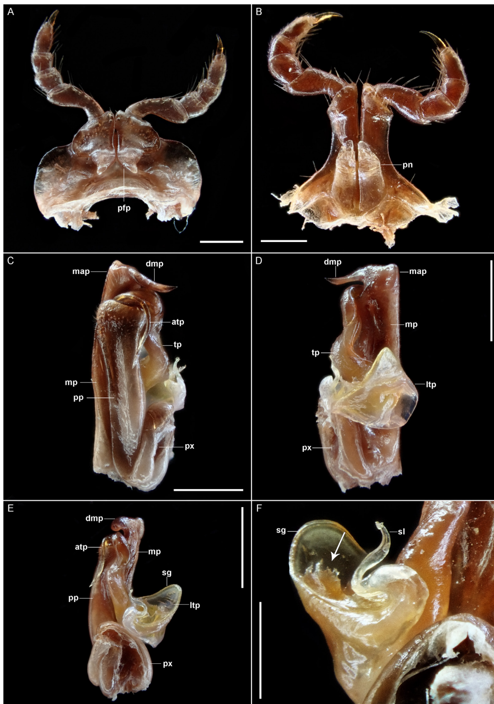
Fig. 5. Autostreptus chilensis (Gervais, 1847), male sexual characters. A, C–E. PG-34-VAL (MNHNCL). B, F. e-8 (MNHNCL). A. First leg-pair, anterior view. B. Second leg-pair, posterior view. C–F. Left gonopod. C. Anterior view. D. Posterior view. E. Lateral view. F. Detail of the distal region of telopodite, lateral view (arrow indicating the protruding serrated zone). Abbreviations: atp = antetorsal process of telopodite; dmp = distolateral metaplica process; ltp = lamellar expansion of telopodite; map = mesoapical metaplica process; mp = metaplica; pfp = prefemoral process of first male leg-pair; pn = penes; pp = proplica; px = paracoxite; sg = seminal groove; sl = solenomere; tp = telopodite. Scale bars: A, F = 0.6 mm; B = 0.5 mm; C = 0.8 mm; D = 1 mm; E = 1.2 mm.