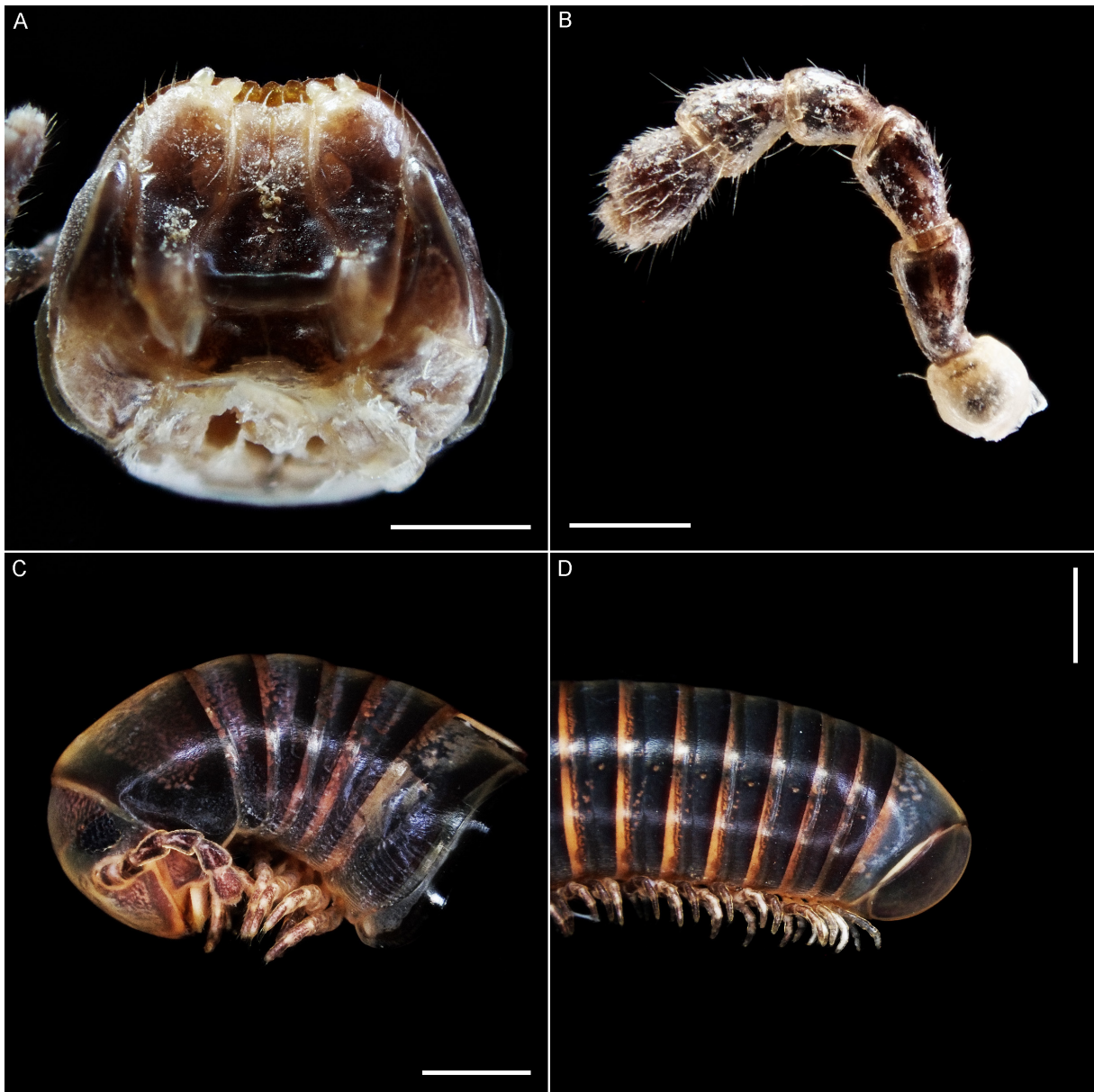
Fig. 8. Autostreptus silvagonzalezi sp. nov., holotype, ♂ (MNHCL 8449). A. Gnathochilarium, ventral view. B. Antenna. C. Head, collum and anterior rings, lateral view. D. Posterior rings and telson, lateral view. Scale bars: A = 0.8 mm; B = 0.5 mm; C = 1.4 mm; D = 1.5 mm.

GONOPOD. Sternum short, trapezoidal. Proplica (pp) ca as long as metaplica (mp) (Fig. 9C–D), parallel-sided, mesal margin curved; pp constricted basally, swollen and rounded distally, with few very short distal setae (Fig. 9C). Metaplica (mp) not complex (Fig. 9C–D); mesal margin thickened, laterally in contact with pp almost along its entire length; mp excavated distally, where antetorsal process (atp) emerges (Fig. 9C); mesoapical metaplica process (map) swollen, rounded (Fig. 9C–D); distolateral metaplica process (dmp) extended from mp excavation, thickened, pointed, directed diagonally ectad (Fig. 9C–E). Telopodite (tp) long, reaching in length pp when stretched, thickened, with torsion of 360° basally (Fig. 9C–D); tp distally diverging in lamellar branch (ltp) and in seminal branch where solenomere (sl) is located (Fig. 9E); ltp curved over seminal branch, not broad, smooth; seminal groove (sg) running marginally on seminal branch (Fig. 9E); antetorsal process (atp) thickened (Fig. 9C, E),