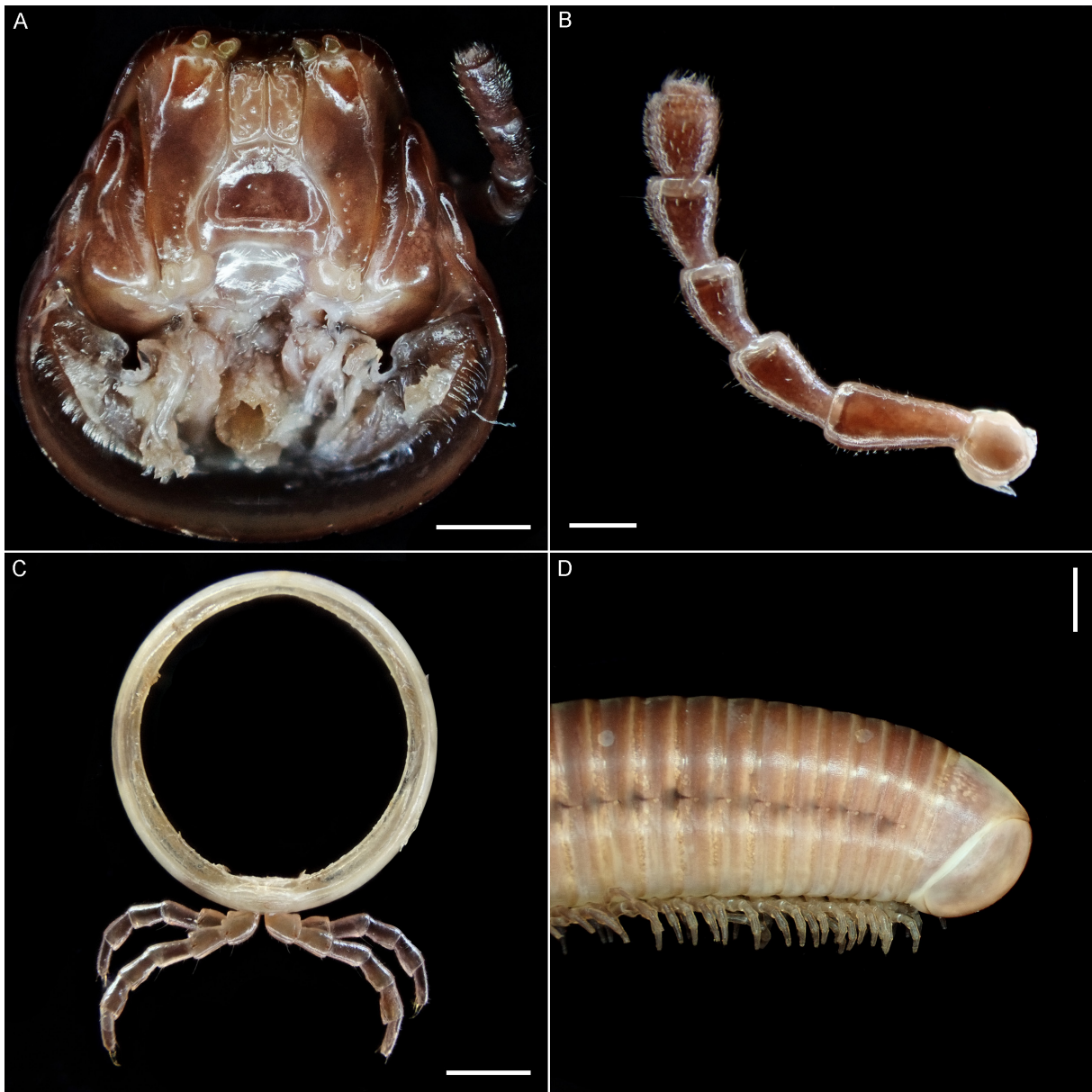
Fig. 6. Autostreptus yanezi Demange & Silva, 1971, ♂ (e-57, MNHNCL). A. Gnathochilarium, ventral view. B. Antenna. C. Midbody ring in oral view. D. Posterior rings and telson, lateral view. Scale bars: A = 0.7 mm; B = 0.4 mm; C = 1 mm; D = 1.2 mm.

LEGS. Midbody legs short, ca \frac{1}{3} of body maximum vertical diameter. Males with postfemoral and tibial adhesive pads from leg-pair 3 on, absent in females; pads gradually smaller towards posterior rings (Fig. 6C). First male leg-pair (Fig. 7A): coxosternum ellipse-shaped, with lateral groups of few short