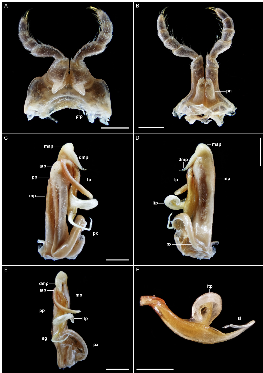
Fig. 9. Autostreptus silvagonzalezi sp. nov., holotype, ♂ (MNHCL 8449), sexual characters. A. First leg-pair, anterior view. B. Second leg-pair, posterior view. C–F. Left gonopod. C. Anterior view. D. Posterior view. E. Lateral view. F. Detail of distal region of telopodite, posterior view. Abbreviations: atp = antetorsal process of telopodite; dmp = distolateral metaplica process; ltp = lamellar expansion of telopodite; map = mesoapical metaplica process; mp = metaplica; pfp = prefemoral process of first male leg-pair; pn = penes; pp = proplica; px = paracoxite; sg = seminal groove; sl = solenomere; tp = telopodite. Scale bars: A, E = 0.6 mm; B–C, F = 0.5 mm; D = 0.7 mm.