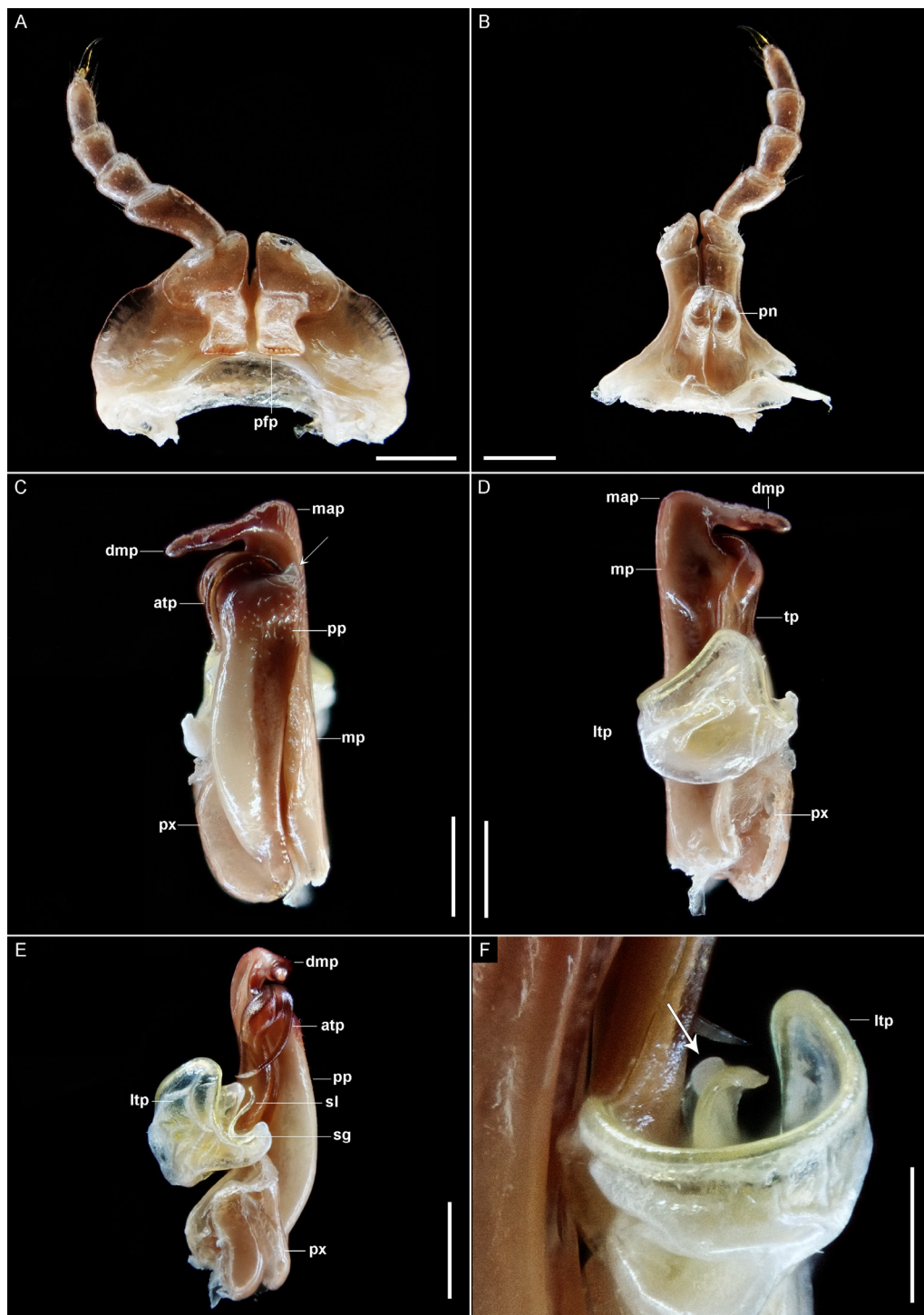
Fig. 7. Autostreptus yanezi Demange & Silva, 1971 (e-57, MNHNCL), male sexual characters. A. First leg-pair, anterior view. B. Second leg-pair, posterior view. C–F. Left gonopod. C. Anterior view (detail of arrow indicating the mesoapical dentiform process on proplica). D. Posterior view. E. Lateral view. F. Detail of distal region of telopodite, medial view (arrow indicating bifurcated process). Abbreviations: atp = antetorsal process of telopodite; dmp = distolateral metaplica process; ltp = lamellar expansion of telopodite; map = mesoapical metaplica process; mp = metaplica; pfp = prefemoral process of first male leg-pair; pn = penes; pp = proplica; px = paracoxite; sg = seminal groove; sl = solenomere; tp = telopodite. Scale bars: A–B = 0.5 mm; C–E = 0.7 mm; F = 0.3 mm.