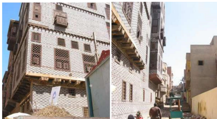
Figure 11. Rosetta Buildings