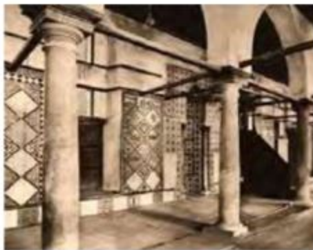
Figure 8. Mosque Saleh Agha Dumaqsis (1704-1721)