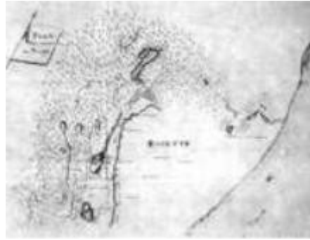
Figure 2. Rosetta 1779