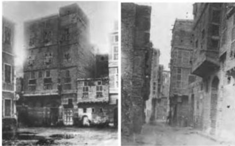
Figure 3. Some ancient postcards of Rosetta houses ("CULTNAT", n.d.).

Rosetta is set to be the second city after Cairo regarding the quantity of its Islamic buildings and houses, it has a unique group of Islamic buildings (there were 54 monuments in 1963 "gates, mosques, wakala, mill, bath, and 39 houses").