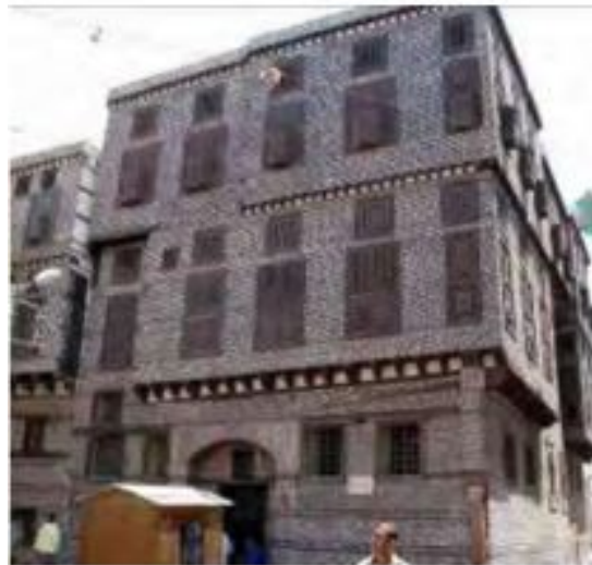
Figure 4. Al-Amasyali