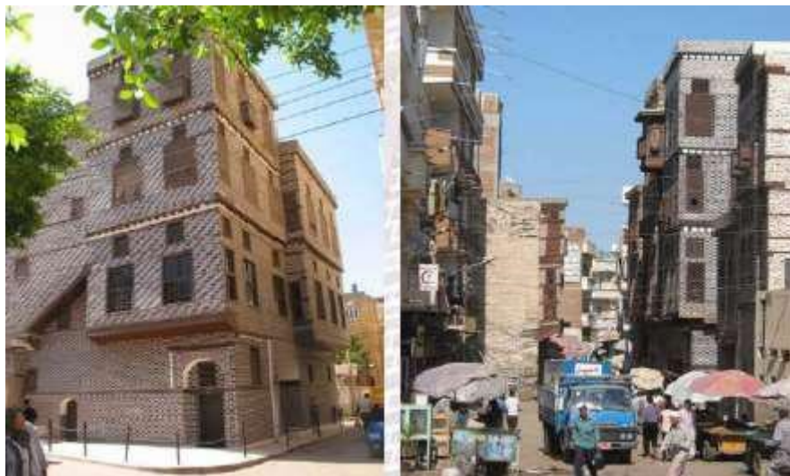
Figure 13. Current situation of the historical residential building in Rosetta.