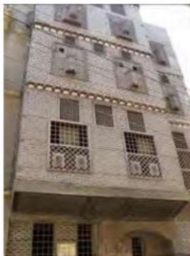
Figure 5. Ismail Ramadan