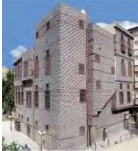
Figure 12. Arab khulli house