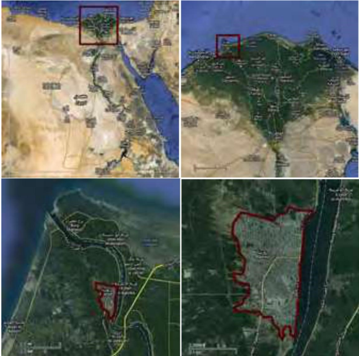
Figure 1. Rosetta location - Source: Google Earth.

Rosetta city lies in the north of Egypt. It is an old port. It is found 12 km away from the mouth of the Rosetta branch of River Nile, along with its western side that flows into in the Mediterranean Sea. Its area is approximately 8 400 000 m 2 with “estimated population” in 2010 about 400,000. Rosetta’s master plan sets guidelines until 2022 that focuses on tourism. It shows different places for activities in the city (“UN Habitat”, 2006).