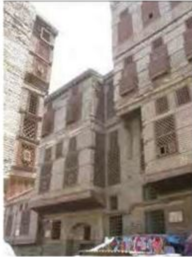
Figure 6. Al-Qanadili