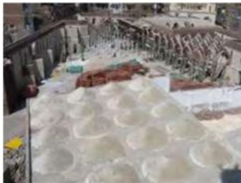
Figure 7. Mosque Zaghulul (1577)