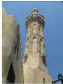
Figure 9. Mosque Al-Mahalli