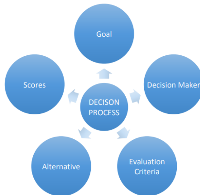
Figure 1. Elements of a decision-making model

Any problem to be solved makes use of decision support, i.e. evaluation techniques.