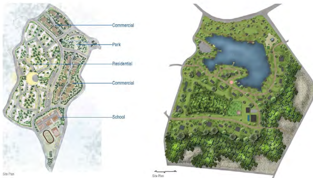
Figure 4. Student's Proposal