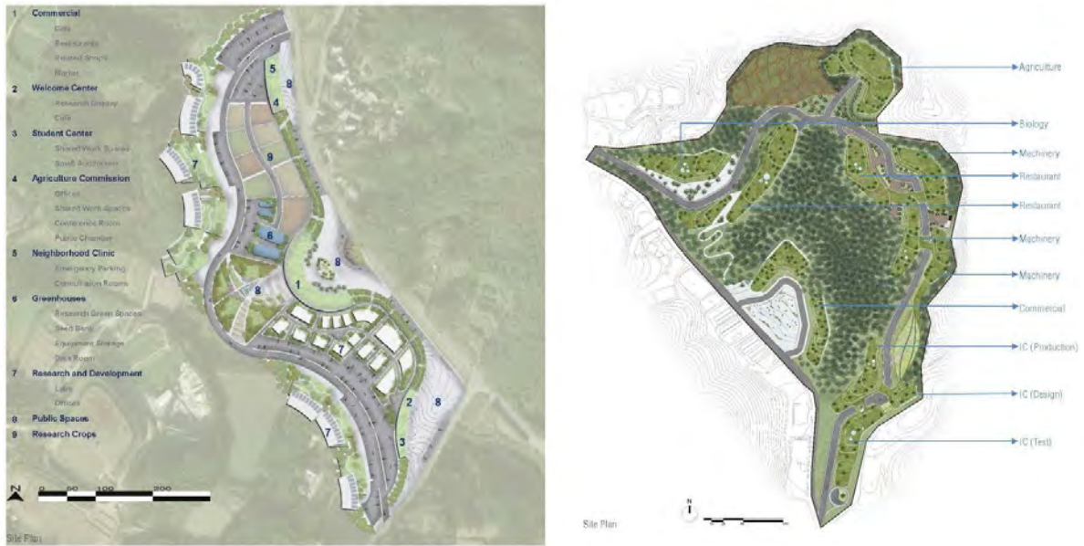
Figure 3. Student's Proposal

Further firefly locations are chosen for when the Itoshima campus and community expands in order to balance work, living, and nature. Each of these small installation will, in time, create a beautiful network of enclaves that allow for good density with the country-style home that one would expect in Itoshima. In all, the master plan allows for a beautifully connected community with fast transportation and an affinity and respect for what makes Itoshima great (Figure 3, Figure 4).