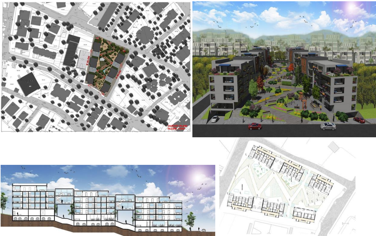
Figure 1. Muhammet Yusuf Birinci - Activity Valley

This building complex in which people are able to meet their social activities, various kinds of sportive activities and the other daily life needs, is located over a sloped land. The upper and lower level streets are connected with the public spaces between the housing blocks which are designed in harmony with the topography. People will prefer to live in these blocks, not only for their need of housing, but also for their social needs which are very important for an urban life. The green roof gardens of the blocks also serve the residents as meeting places, see Figure 1.