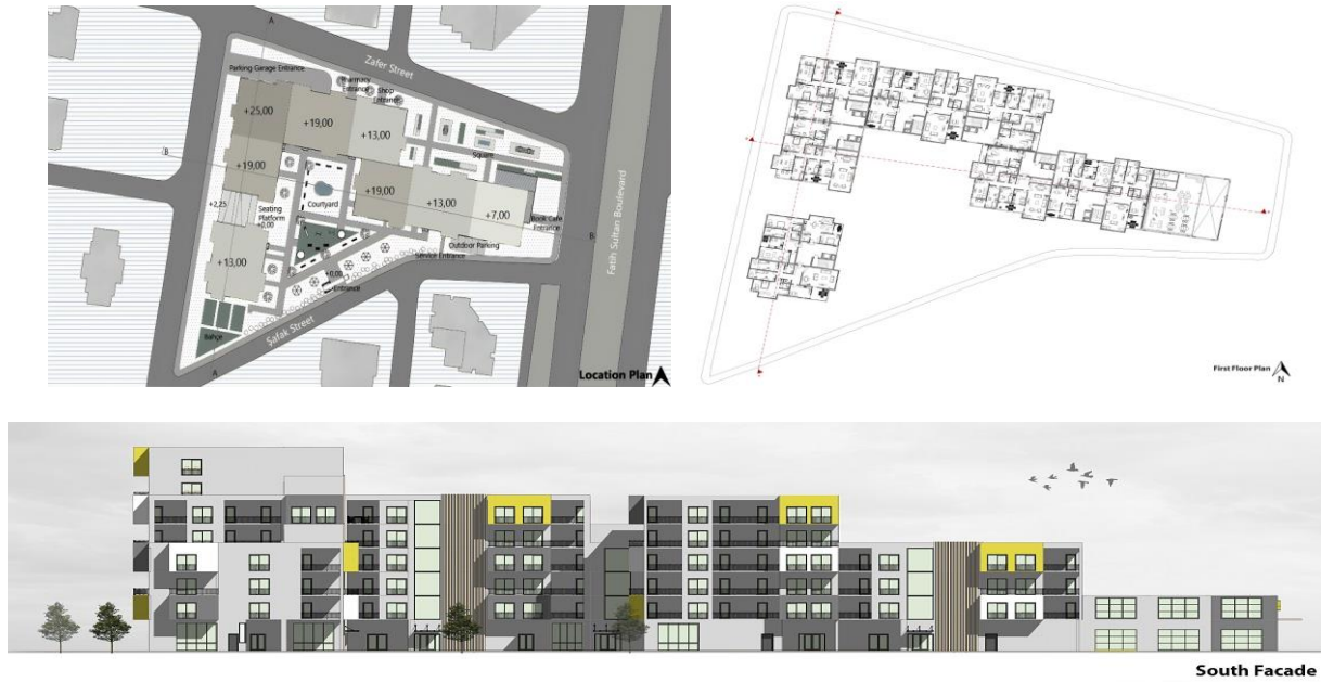
Figure 4. Zeynep Sena Sancak - Modular Living Space

The main aim of this mixed used housing complex is to offer social activities and shopping alternatives not only for its residents, but also for local people. The ground floor includes commercial and social spaces that are integrated with the public garden in the middle of the three main blocks. The uninterrupted pedestrian alley connects the main street with a greater public garden while the commercial axis invites people to the courtyard, which is an intersection of activities, see Figure 5.