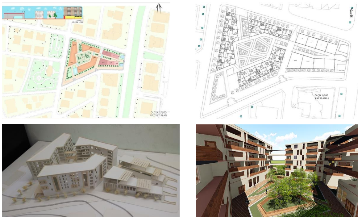
Figure 5. Merlinda Mollavequri- Intersection of Activities

The main aim of this mixed used housing complex is to offer social activities and shopping alternatives not only for its residents, but also for local people. The ground floor includes commercial and social spaces that are integrated with the public garden in the middle of the three main blocks. The uninterrupted pedestrian alley connects the main street with a greater public garden while the commercial axis invites people to the courtyard, which is an intersection of activities, see Figure 5.