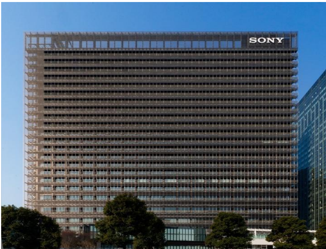
Figure 4. Bioskin of Sony City Osaki, Tokyo

The Bamboo Roof is characterized by a free-form roof structure that develops with unlimited geometric possibilities. The concept is both simple and complex at the same time. The structure is created by fitting together a series of units of parts, each made up of four bamboo boards connected together by metal pins. Finally, the corrugated roof is supported by metal supports. Bamboo Roof conveys a great sense of lightness and transparency, so much so that one has the perception of being under the canopy of a forest. These techniques represent an important reflection on the developments in the use of bamboo for construction in Italy.