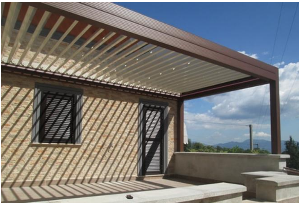
Figure 3. Bioclimatic pergola (Gibus)

The pergolas, which offer protection from atmospheric agents, can be completed with opening windows. The pergola, closed on all sides, with the possibility of opening the windows in summer and combining them with shading awnings, offers an ideal microclimate all year round: in summer, the windows that can be opened favor natural ventilation and the curtains shield the interior of the pergola from the sun. In winter, however, the closed windows protect against atmospheric agents.