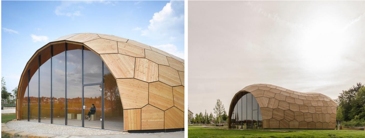
Figure 9. Landesgartenschau Exhibition hall, Stuttgart

characterized by speed of construction; very precise manufacturing; efficient and advanced detection methods; having a building shell and structure at the same time and striking visual effects inside and outside.