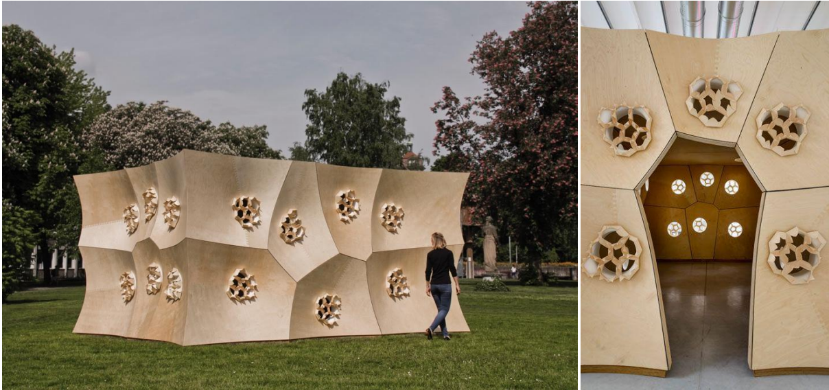
Figure 8. Hygroskin Pavilion, Stuttgart

The millimeter precision with which these elements have been carved, thanks to a 3D laser printer robot, allows Hygroskin to react naturally to the change of external weather conditions: simulating the behavior of the scales of the pinecone, when it rains and the humidity increases, the openings close up on themselves; while during the sunny days when the internal temperature increases the thin wooden sheets contract, increasing the width of the openings (Menges et al. 2015).