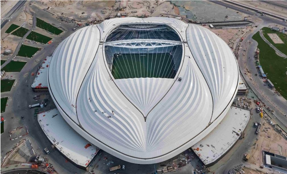
Figure 10. Al Janoub Stadium, Qatar